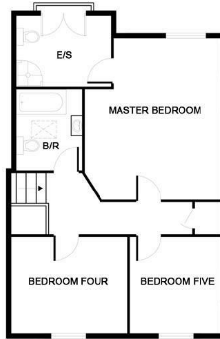
Upper First Floor