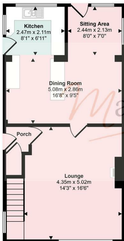
Ground Floor Approx 52 sq m / 564 sq ft