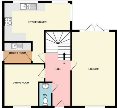
GROUND FLOOR 685 sq.ft. (63.6 sq.m.) approx.