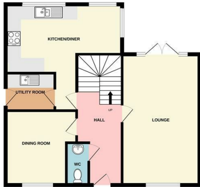
GROUND FLOOR 685 sq.ft. (63.6 sq.m.) approx.