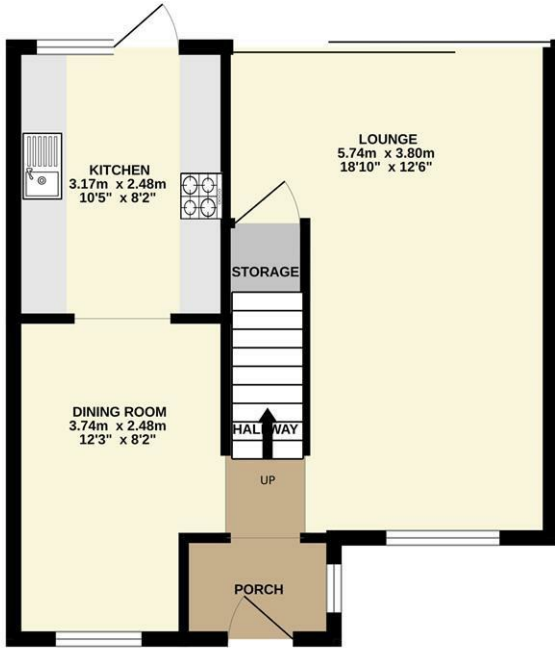
GROUND FLOOR 40.4 sq.m. (435 sq.ft.) approx.