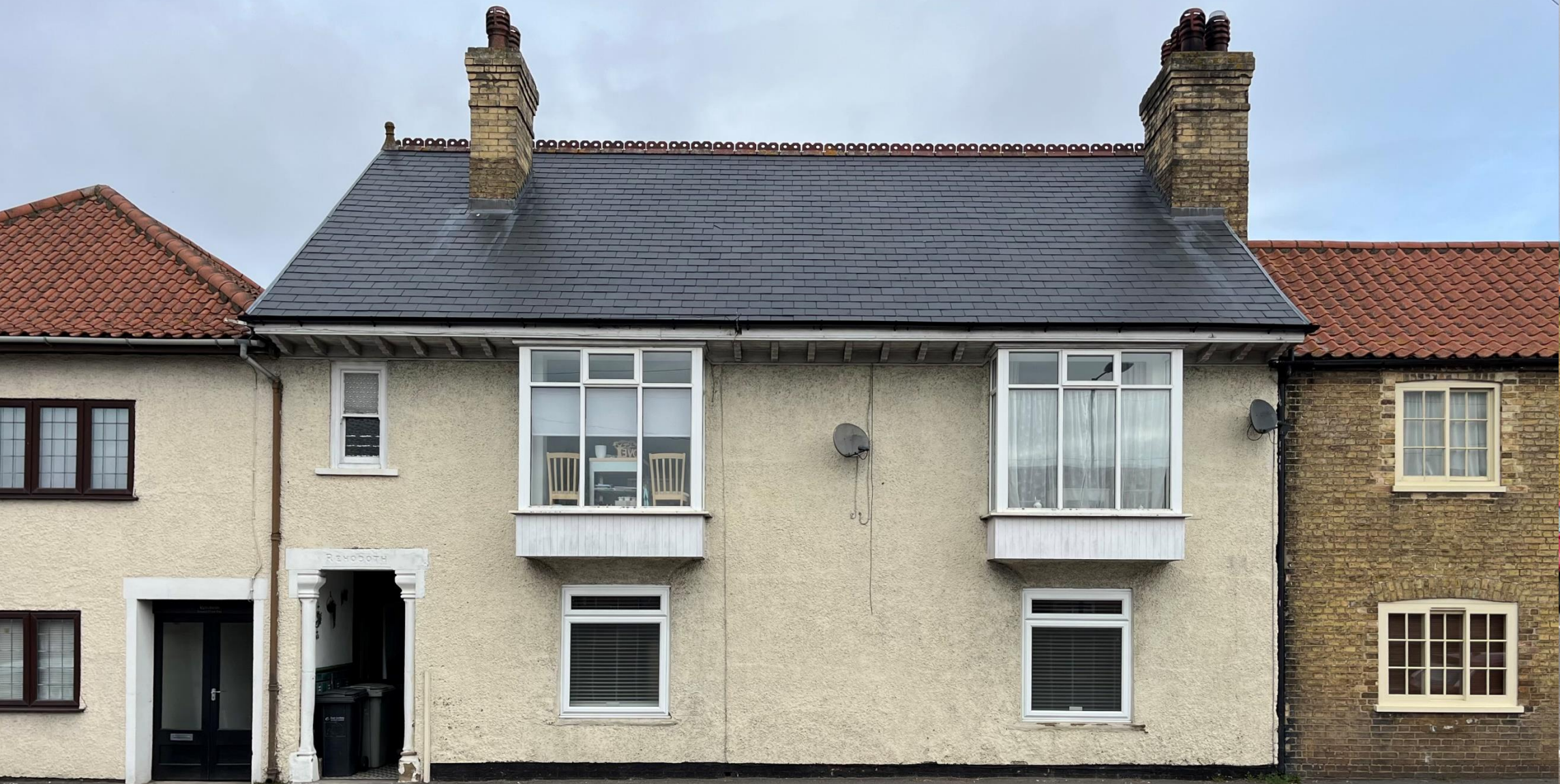
First Floor Flat - Rehoboth Lincoln Road, Wragby, Market Rasen, Lincolnshire. LN8 5ND