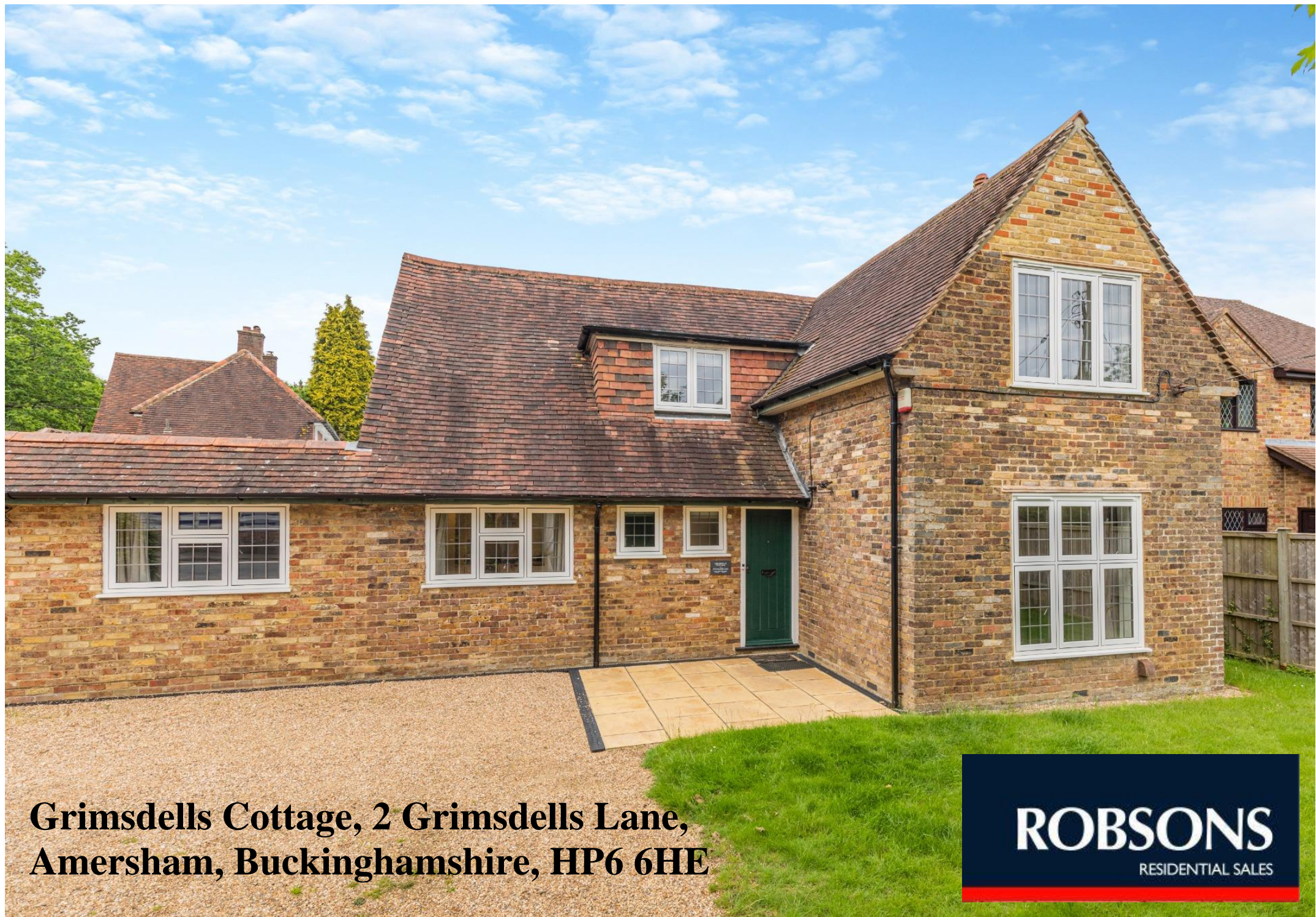
Grimsdells Cottage, 2 Grimsdells Lane, Amersham, Buckinghamshire, HP6 6HE