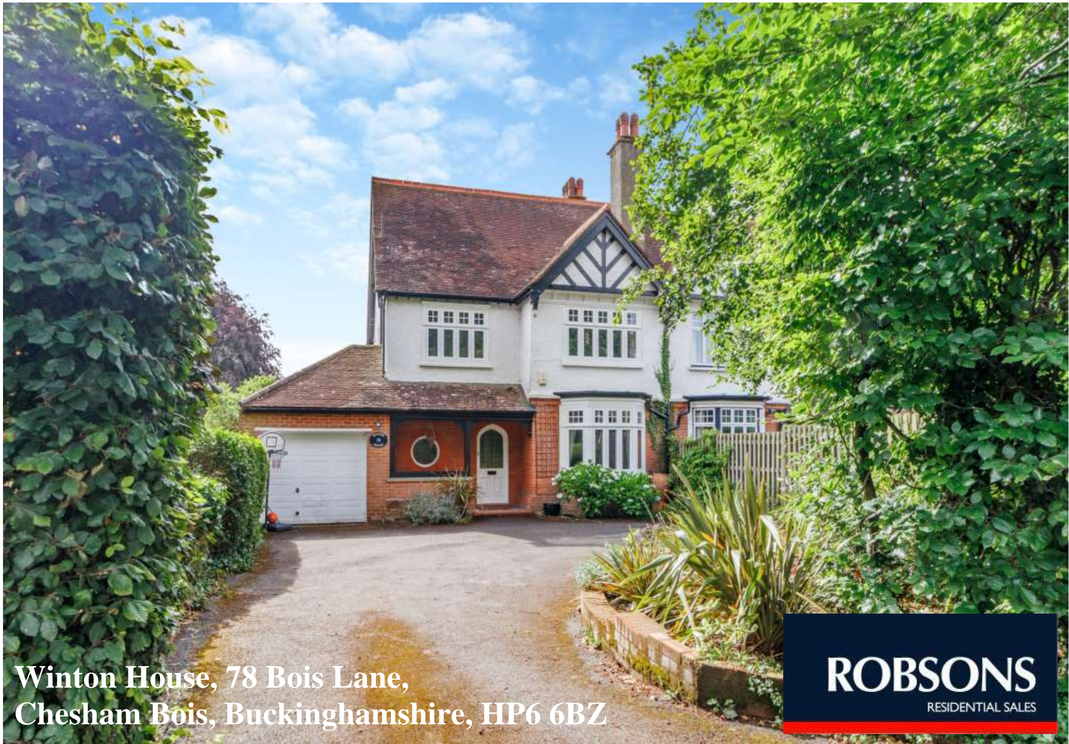
Winton House, 78 Bois Lane, Chesham Bois, Buckinghamshire, HP6 6BZ