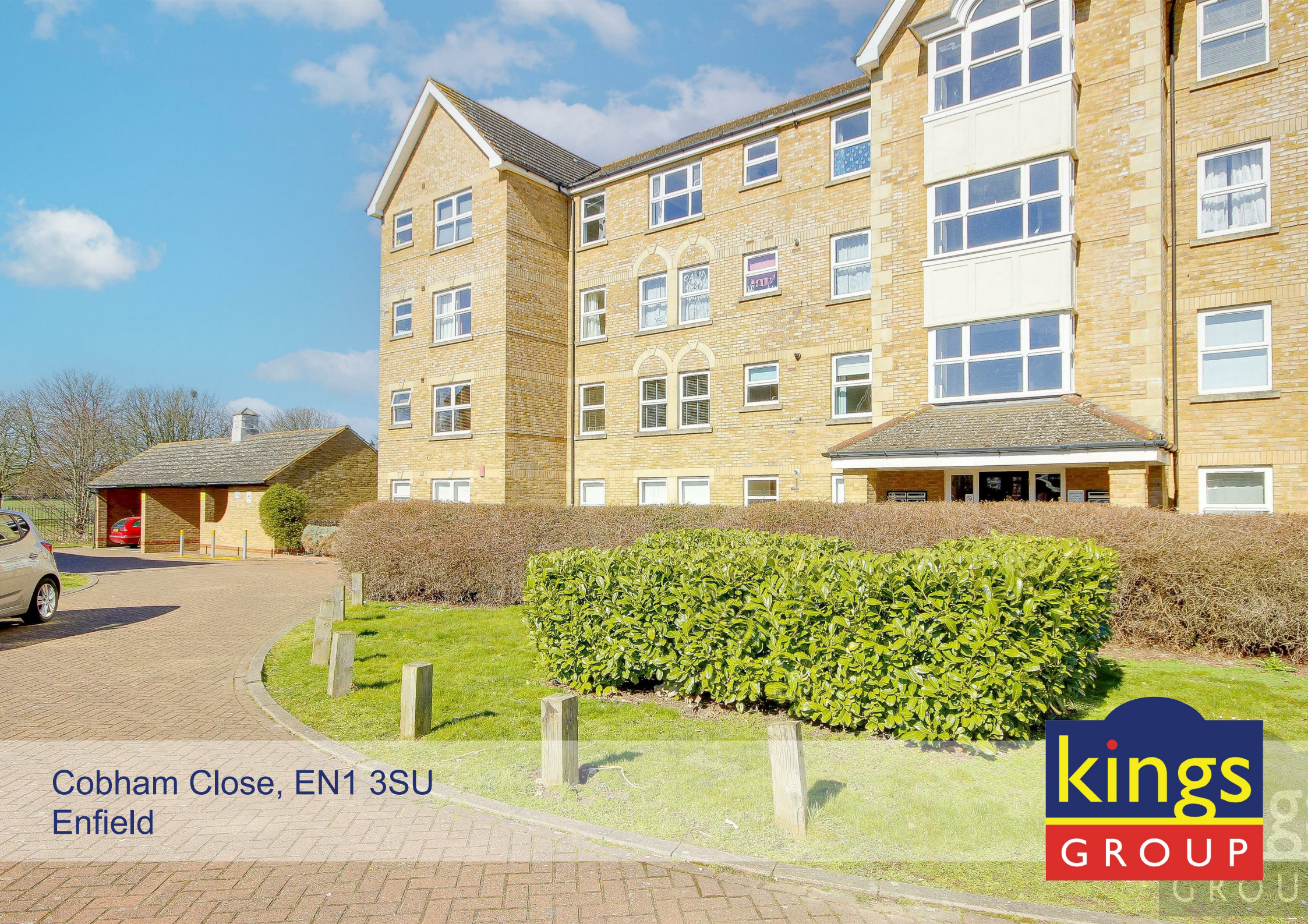
Cobham Close, EN1 3SU Enfield