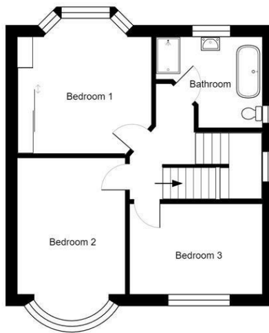
Second Floor Area: approx 33.3 m 2 ... 359 ft 2