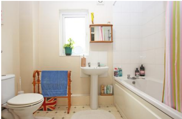
GROUND FLOOR 424 sq.ft. (39.3 sq.m.) approx.