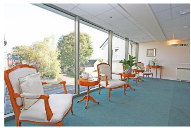
Residents' communal areas