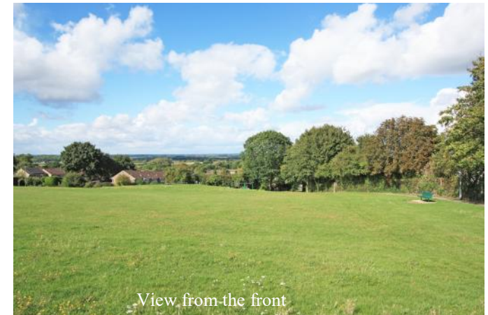
View from the front

DISCLAIMER. These particulars, whilst believed to be accurate are set out as a general outline for guidance and do not constitute any part of an offer or contract. Intending purchasers should not rely on them as statements or representation of fact, but must satisfy themselves by inspection or otherwise as to their accuracy. No person in this firm's employment has the authority to make or give any representation or warranty in respect of the property. Floor plan measurements and distances are approximate only. We have not carried out a detailed survey nor tested the services, appliances or specific fittings. Your home is at risk if you do not keep up repayments on a mortgage or other loan secured on it.