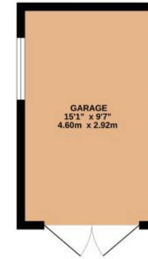
GARAGE 147 sq.ft. (13.7 sq.m.) approx.