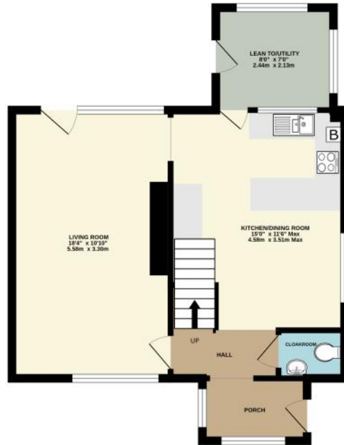
GROUND FLOOR 494 sq.ft. (45.9 sq.m.) approx.