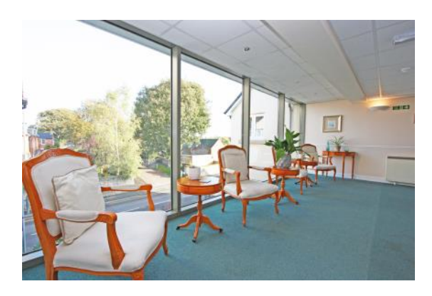
Residents' communal areas