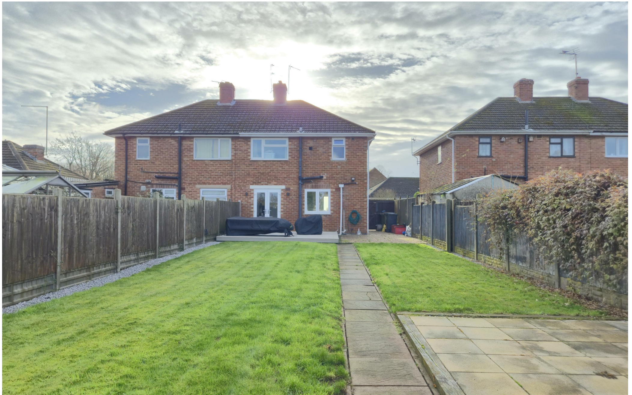
14 Clover Place, Thringstone, Leicestershire, LE67 8LD