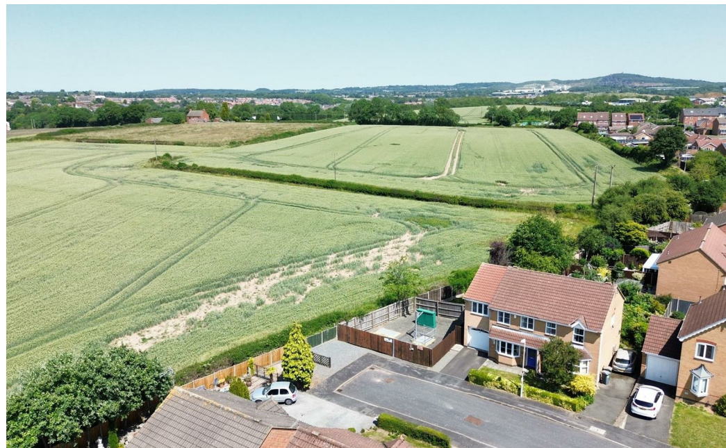
28 Channing Way, Ellistown, Leicestershire, LE67 1HA