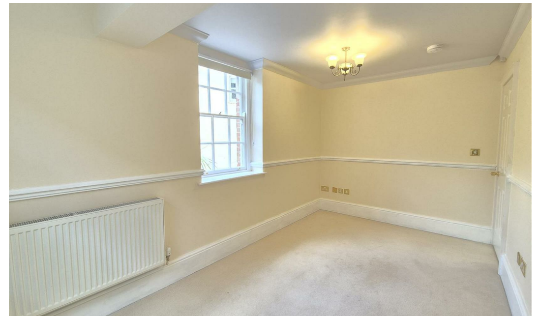
The Ashby, Apartment 2, Coleorton Hall Constable Way, Coleorton, Leicestershire, LE67 8FZ