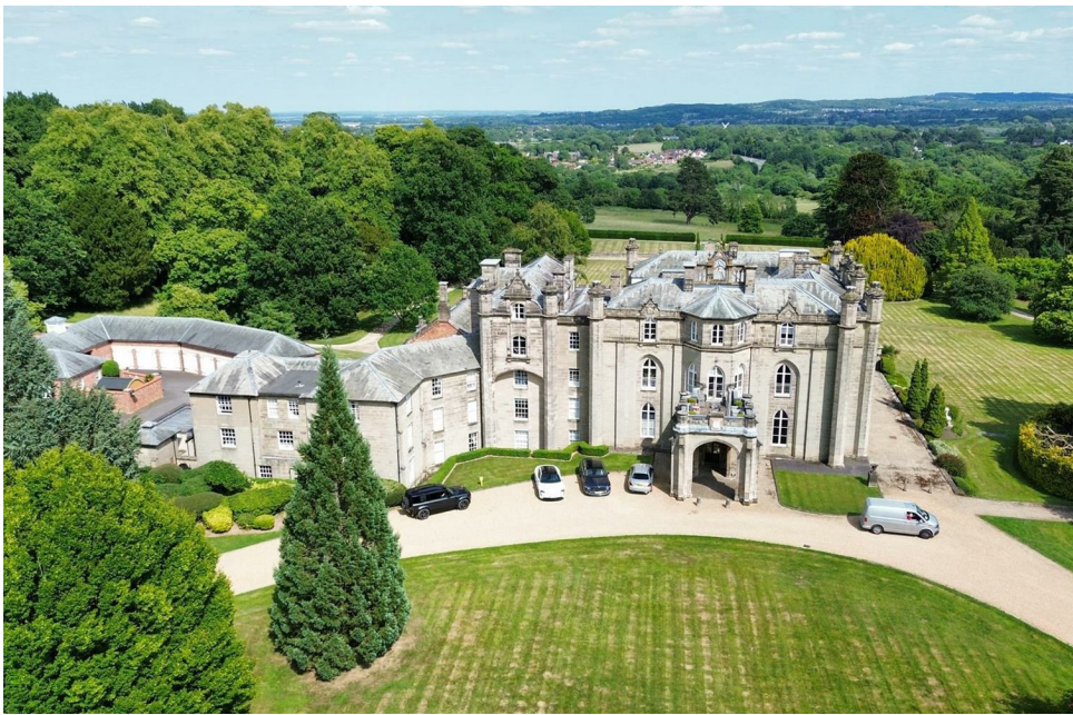
The Ashby, Apartment 2, Coleorton Hall Constable Way, Coleorton, Leicestershire, LE67 8FZ