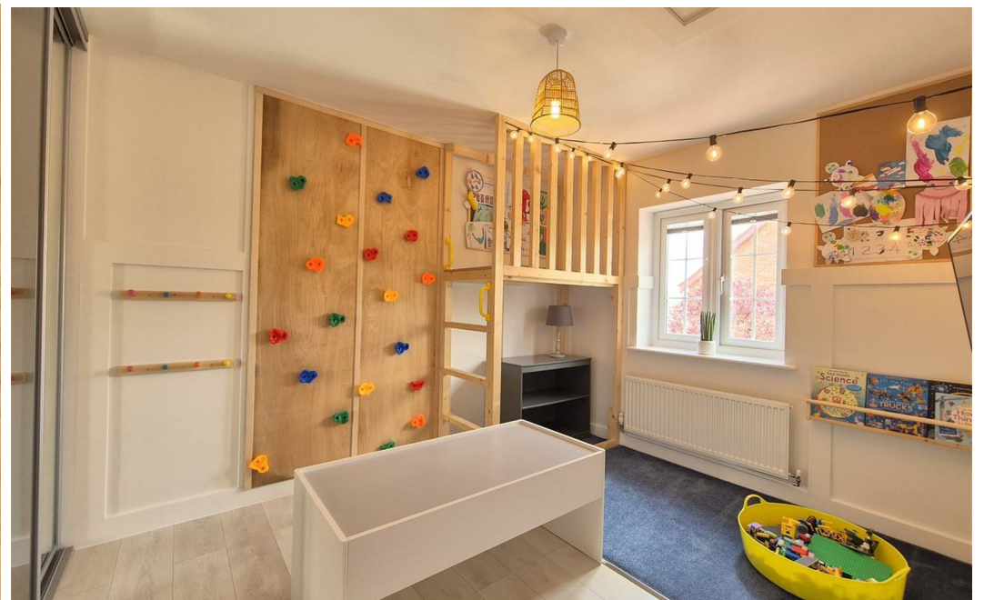
11 Woodstone Lane, Ravenstone, Leicestershire, LE67 2DT