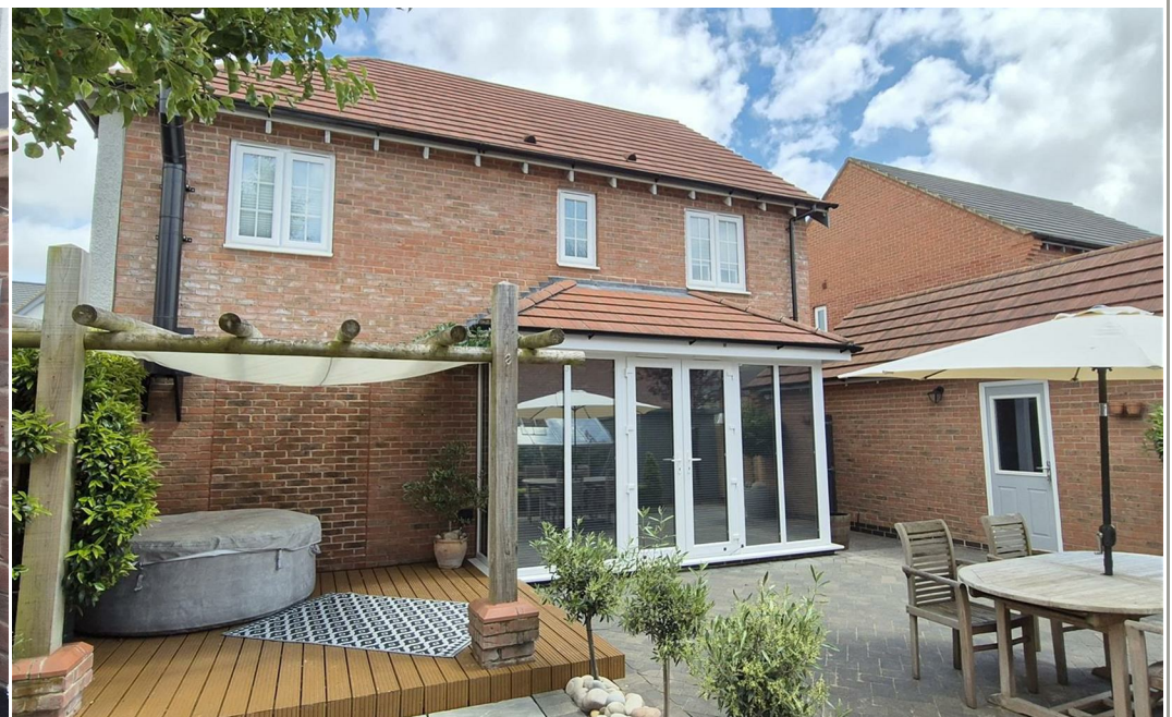
11 Woodstone Lane, Ravenstone, Leicestershire, LE67 2DT