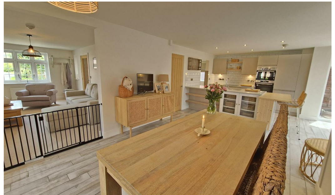
11 Woodstone Lane, Ravenstone, Leicestershire, LE67 2DT