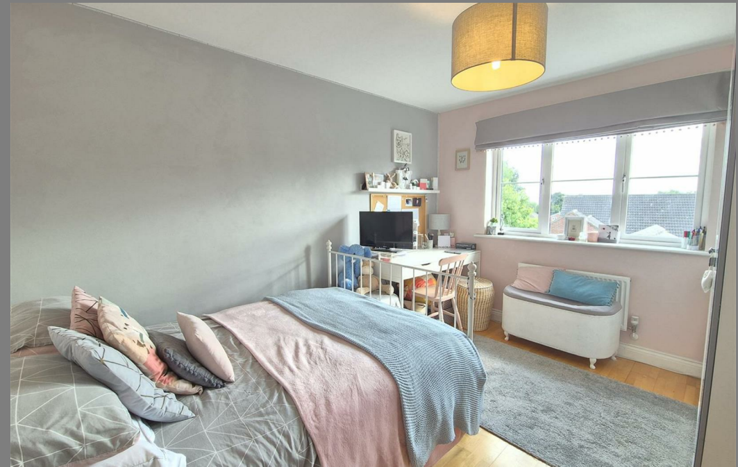
11 Ashby Road, Markfield, Leicestershire, LE67 9UB