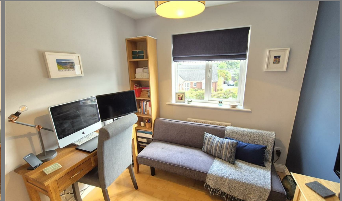
11 Ashby Road, Markfield, Leicestershire, LE67 9UB