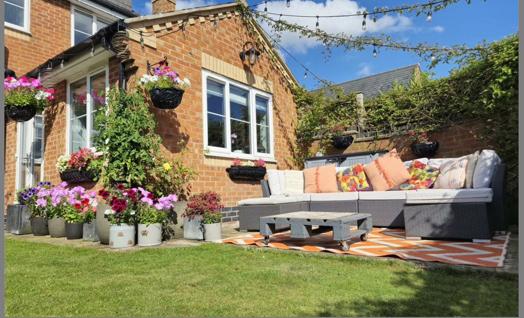
11 Ashby Road, Markfield, Leicestershire, LE67 9UB