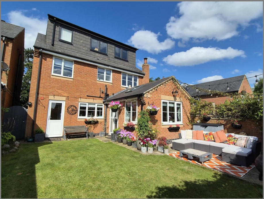
11 Ashby Road, Markfield, Leicestershire, LE67 9UB