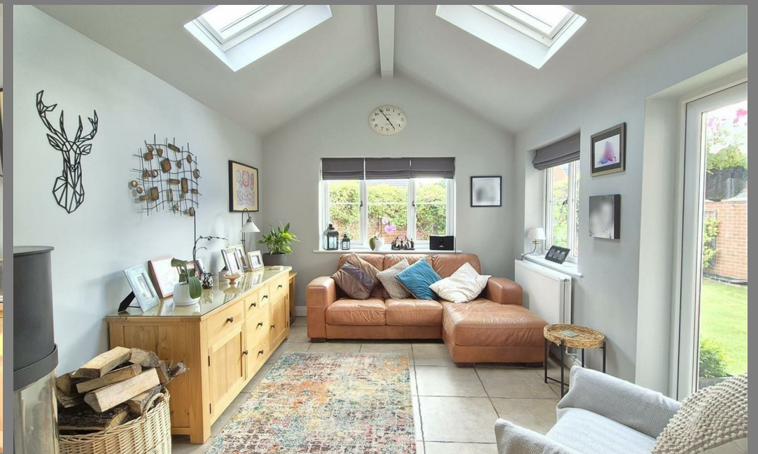
11 Ashby Road, Markfield, Leicestershire, LE67 9UB