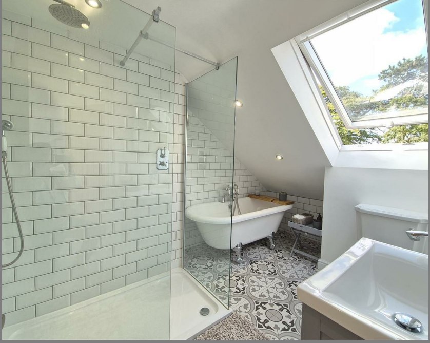
11 Ashby Road, Markfield, Leicestershire, LE67 9UB