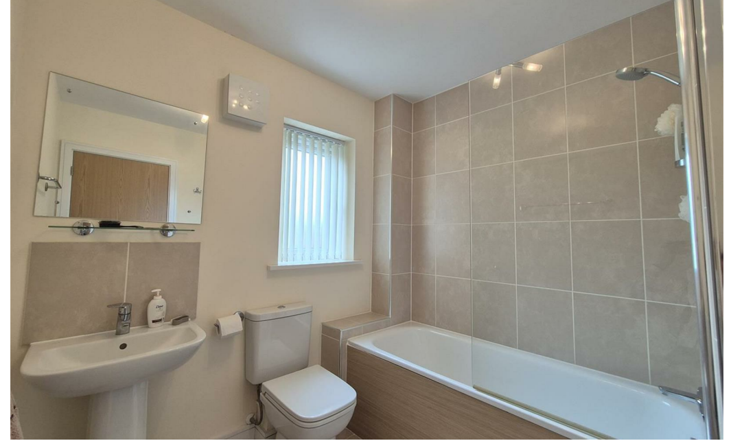
29 Hemlock Road, Ravenstone, Leicestershire, LE67 3NZ