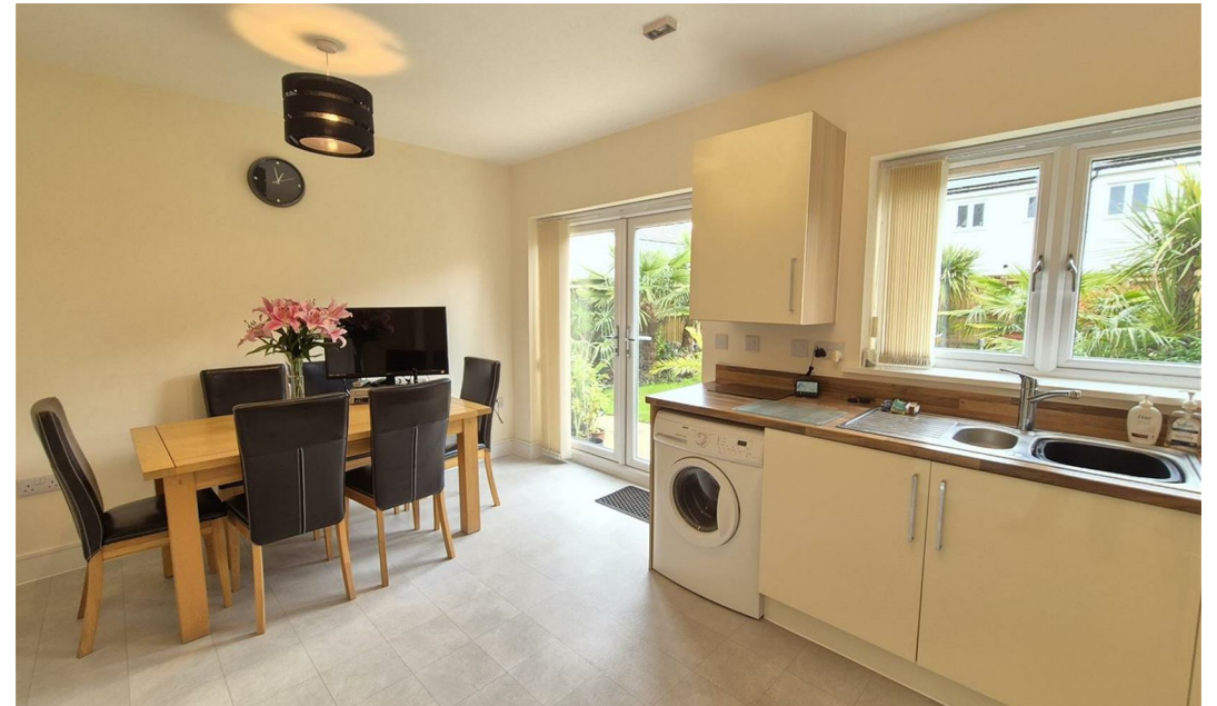
29 Hemlock Road, Ravenstone, Leicestershire, LE67 3NZ