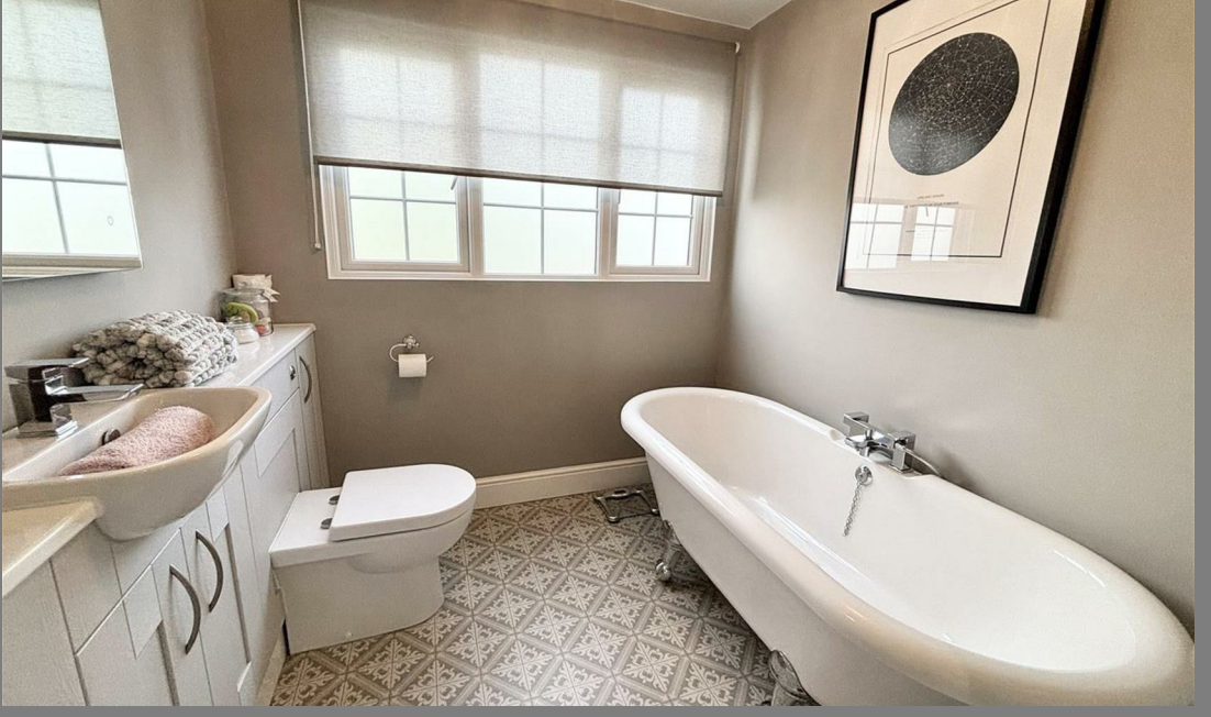
4 Dauphine Close, Coalville, Leicestershire, LE67 4QQ