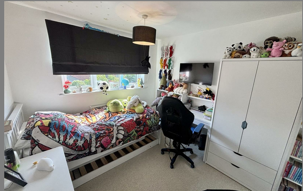
4 Dauphine Close, Coalville, Leicestershire, LE67 4QQ