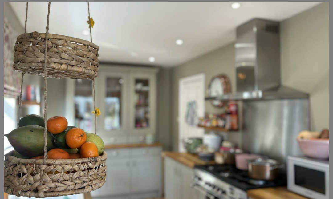
4 Dauphine Close, Coalville, Leicestershire, LE67 4QQ