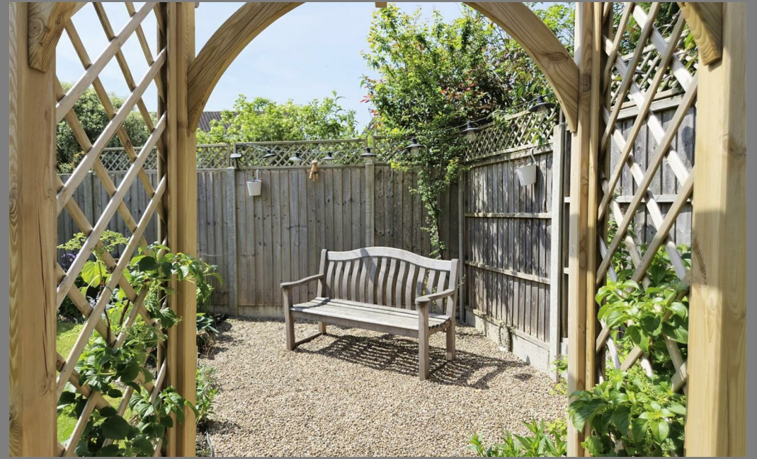
4 Dauphine Close, Coalville, Leicestershire, LE67 4QQ