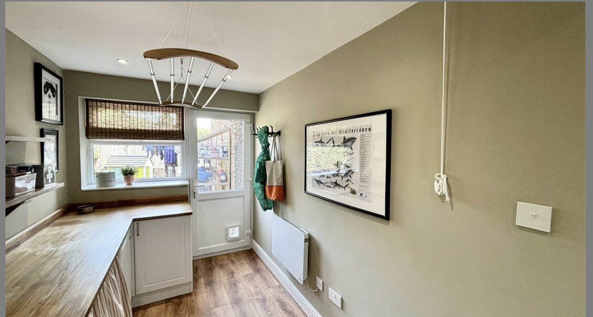
4 Dauphine Close, Coalville, Leicestershire, LE67 4QQ