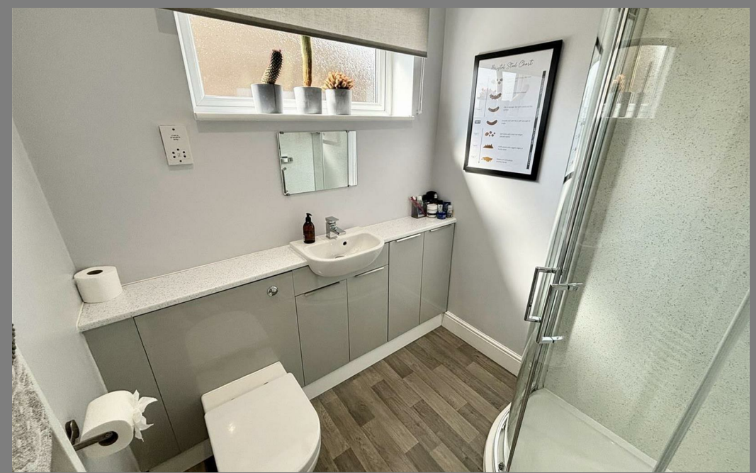
4 Dauphine Close, Coalville, Leicestershire, LE67 4QQ