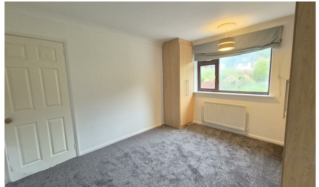
107 St. Bernards Road, Whitwick, Leicestershire, LE67 5GY