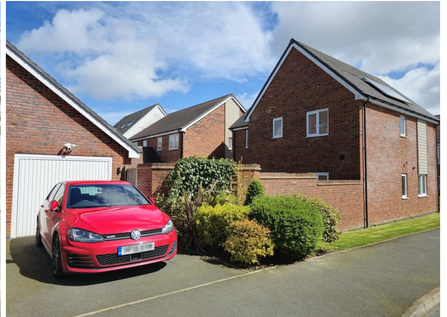
41 Hemlock Road, Ravenstone, Leicestershire, LE67 3NZ