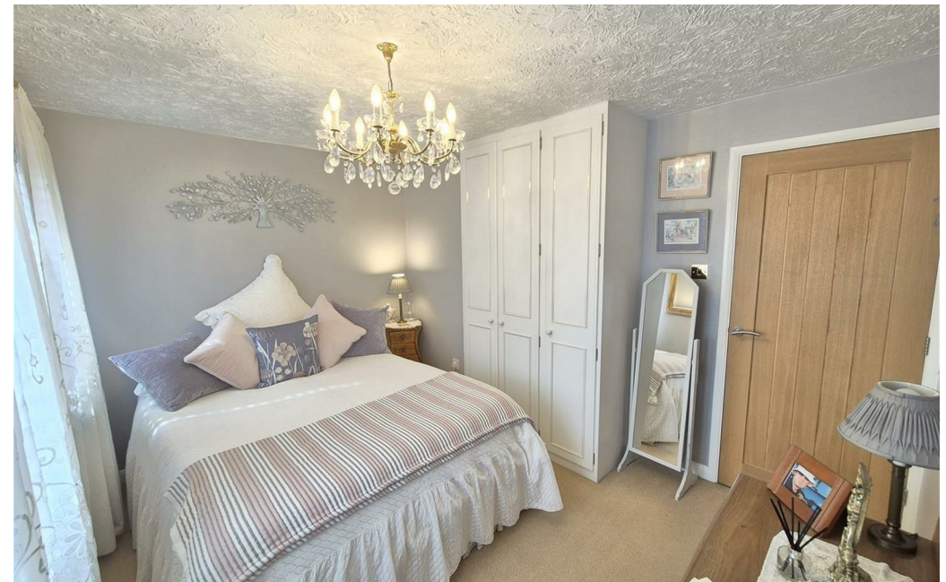
1 Pickering Drive, Ellistown, Leicestershire, LE67 1HB