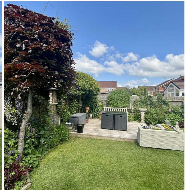
1 Pickering Drive, Ellistown, Leicestershire, LE67 1HB