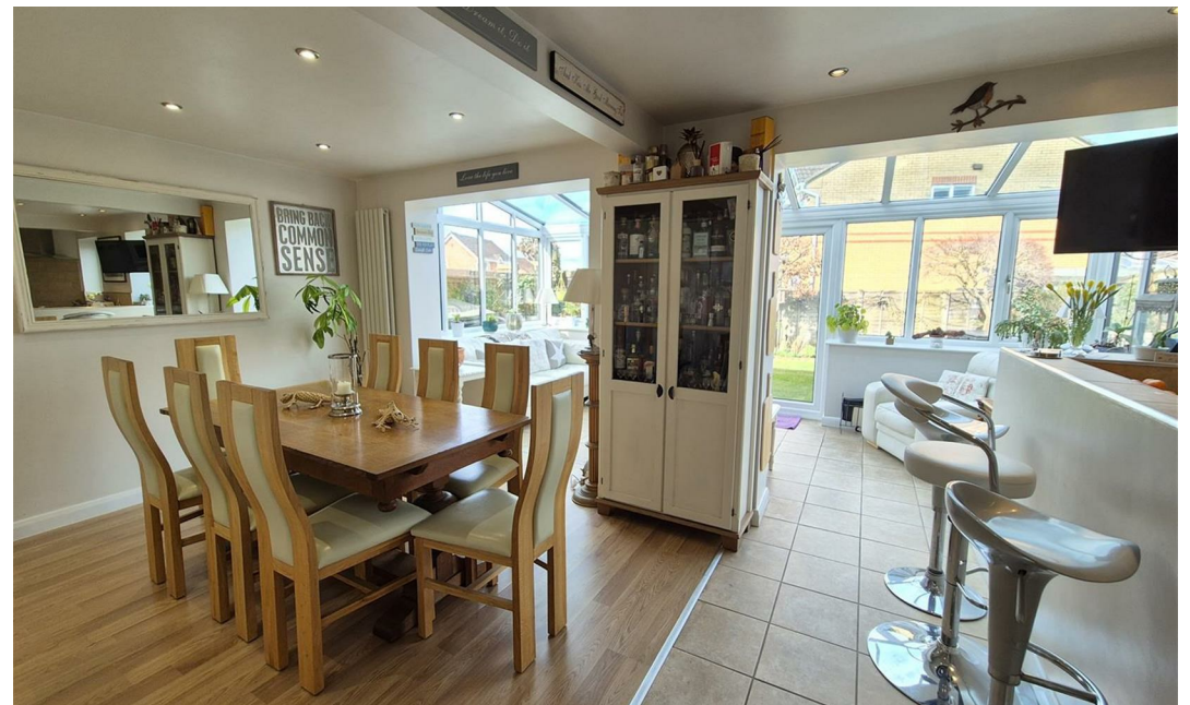
1 Pickering Drive, Ellistown, Leicestershire, LE67 1HB