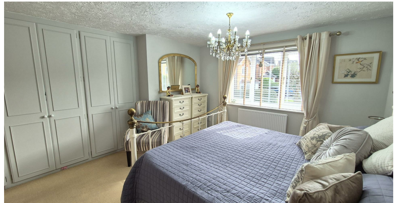
1 Pickering Drive, Ellistown, Leicestershire, LE67 1HB