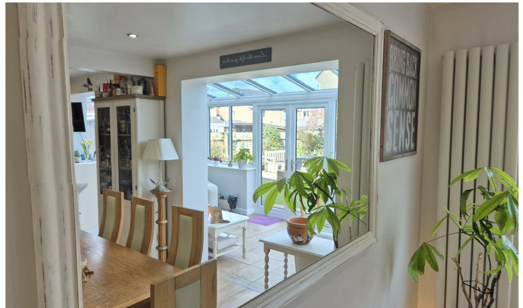
1 Pickering Drive, Ellistown, Leicestershire, LE67 1HB