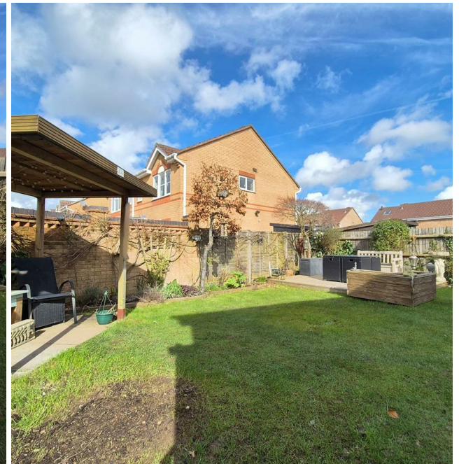
1 Pickering Drive, Ellistown, Leicestershire, LE67 1HB