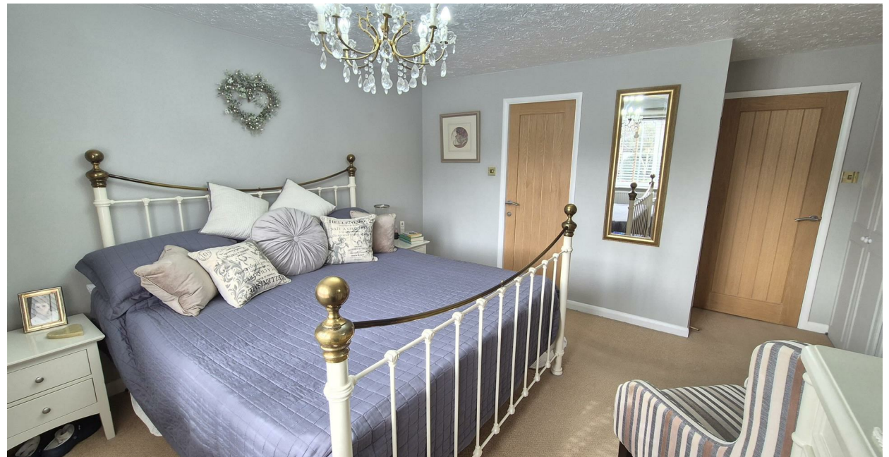
1 Pickering Drive, Ellistown, Leicestershire, LE67 1HB