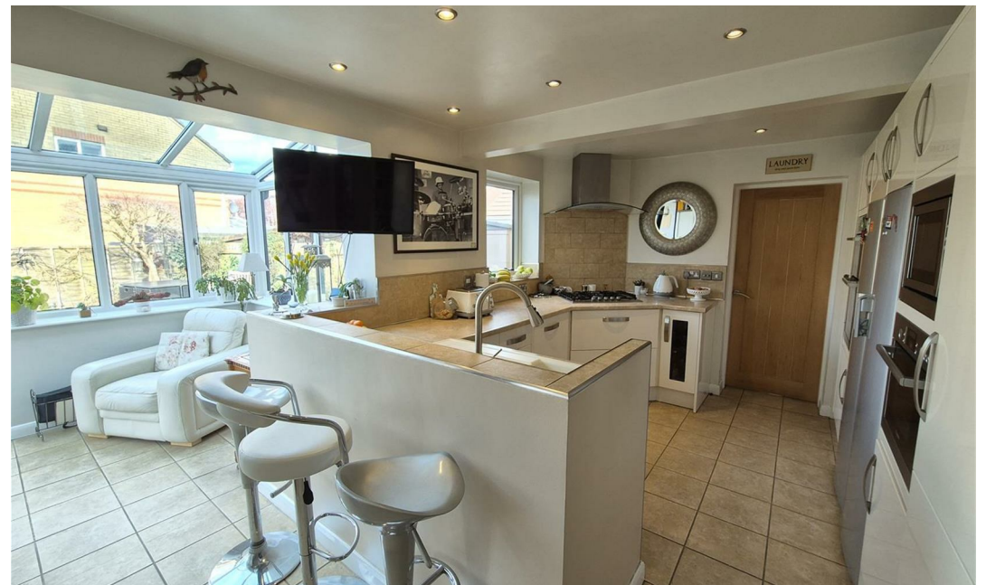
1 Pickering Drive, Ellistown, Leicestershire, LE67 1HB