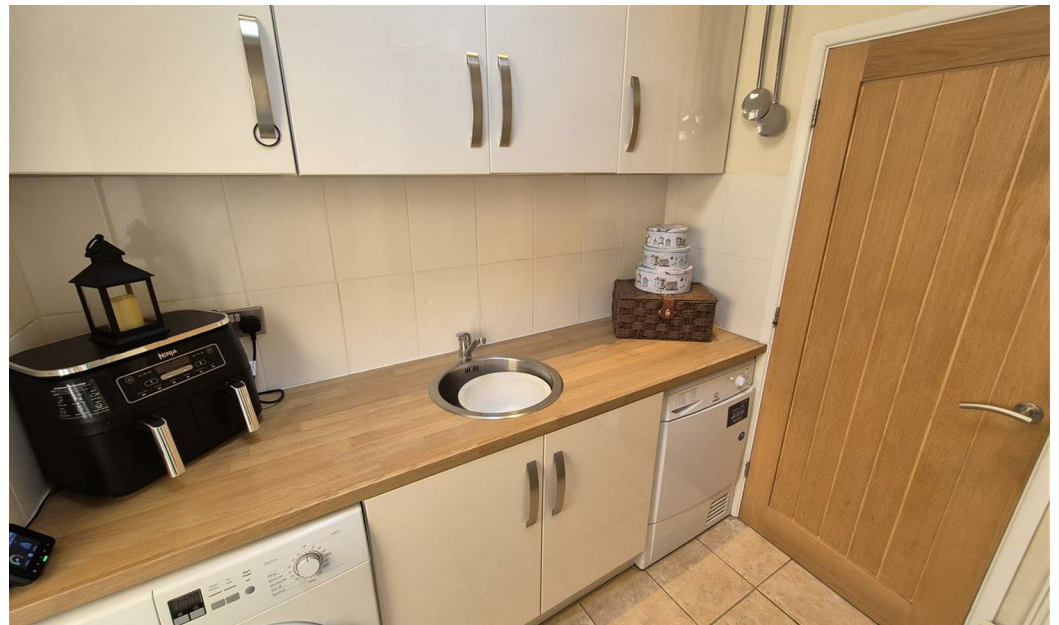
1 Pickering Drive, Ellistown, Leicestershire, LE67 1HB