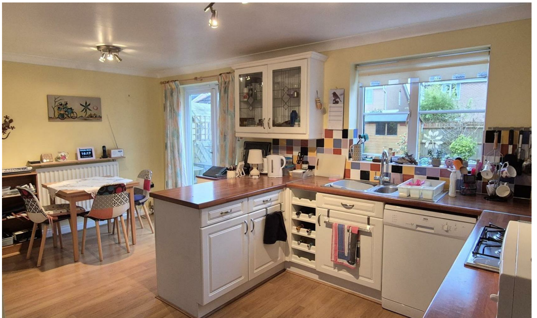
3 Stimpson Road, Coalville, Leicestershire, LE67 4EN