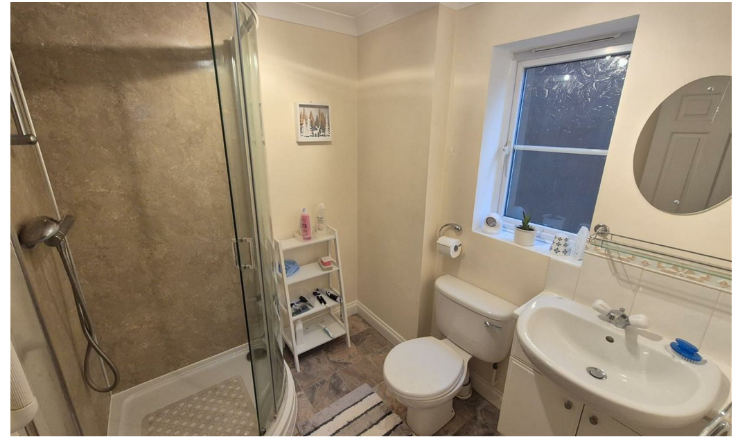
3 Stimpson Road, Coalville, Leicestershire, LE67 4EN