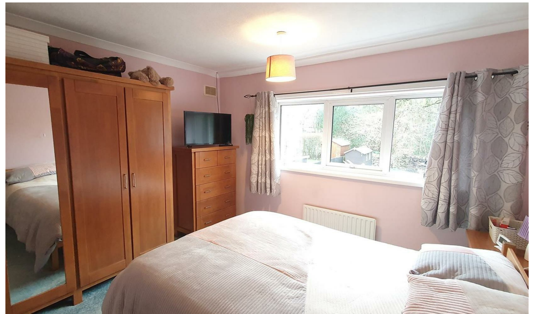
5 Birch Avenue, Whitwick, Leicestershire, LE67 5GB