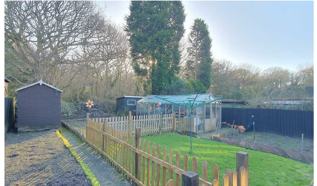
5 Birch Avenue, Whitwick, Leicestershire, LE67 5GB