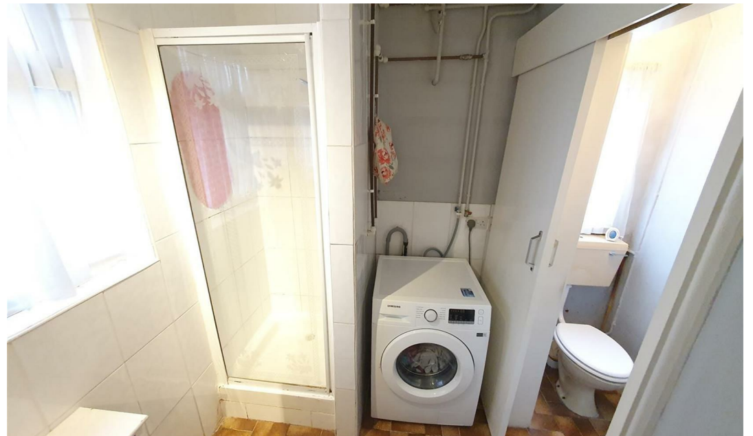
5 Birch Avenue, Whitwick, Leicestershire, LE67 5GB