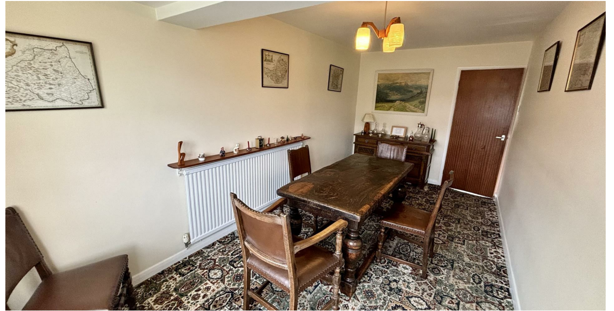
3 Nelson Fields, Coalville, Leicestershire, LE67 4DY