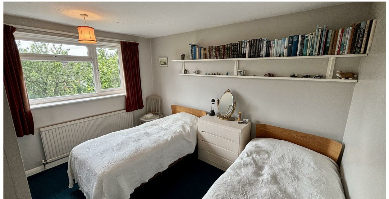
3 Nelson Fields, Coalville, Leicestershire, LE67 4DY