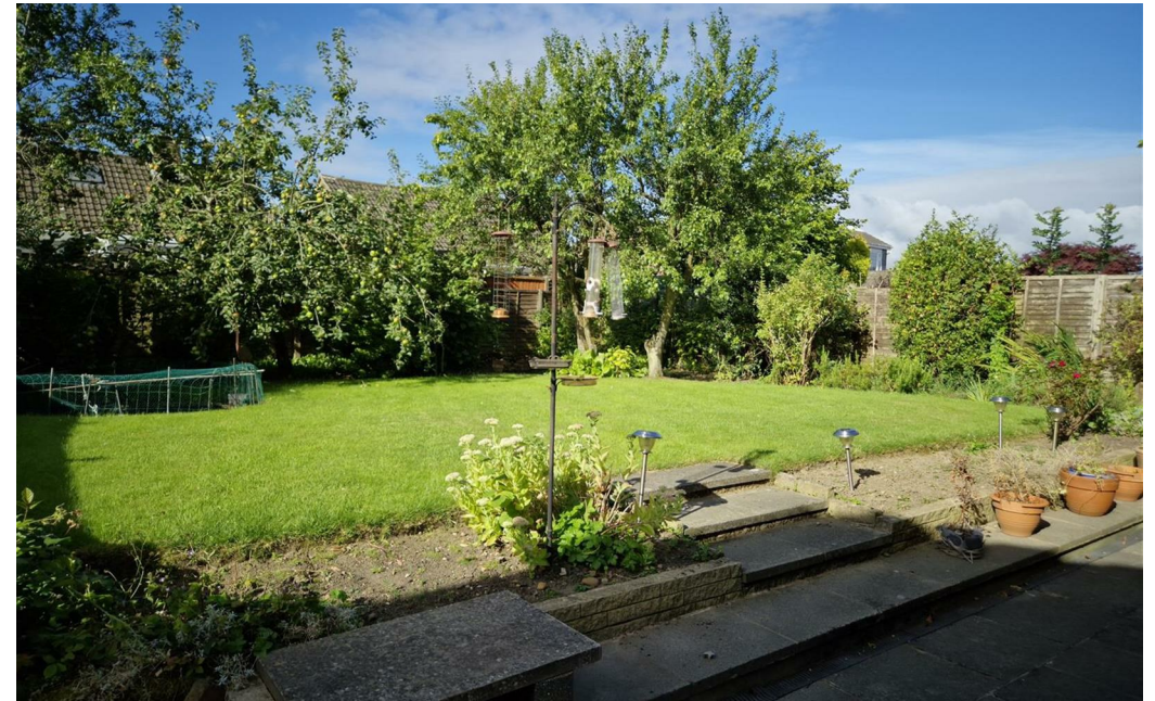
3 Nelson Fields, Coalville, Leicestershire, LE67 4DY