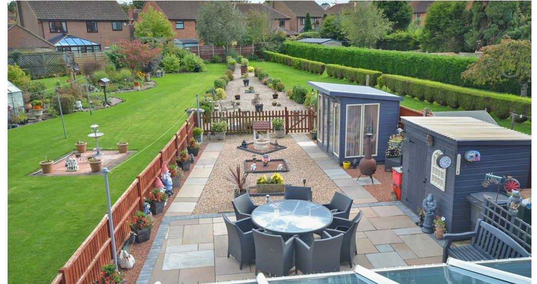
60 Ashby Road, Osgathorpe, Leicestershire, LE12 9SR