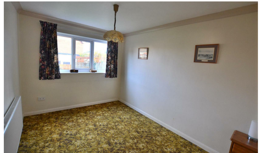
8 Romway Close, Shepshed, Loughborough, LE12 9DT