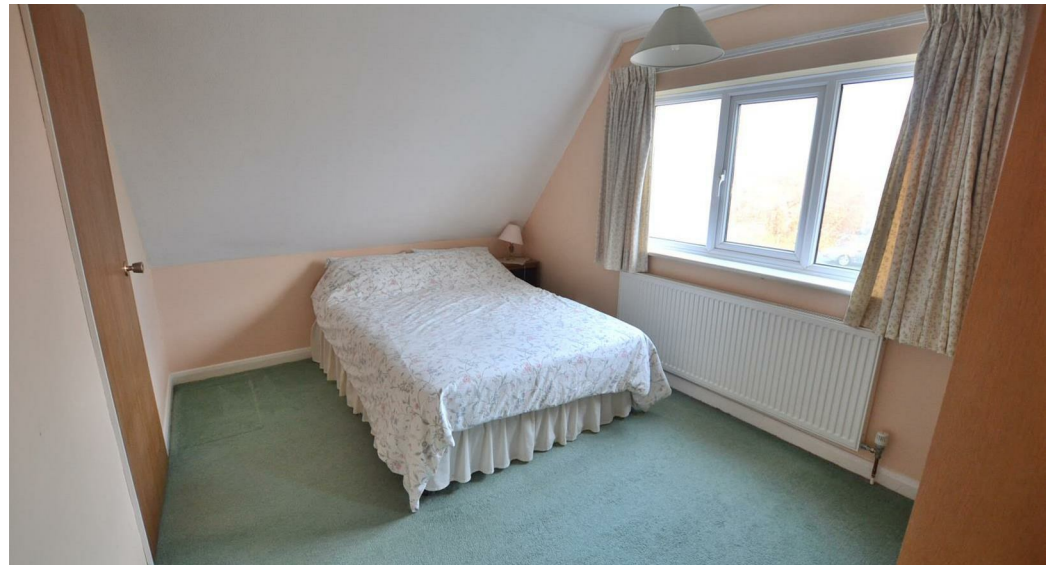
8 Romway Close, Shepshed, Loughborough, LE12 9DT