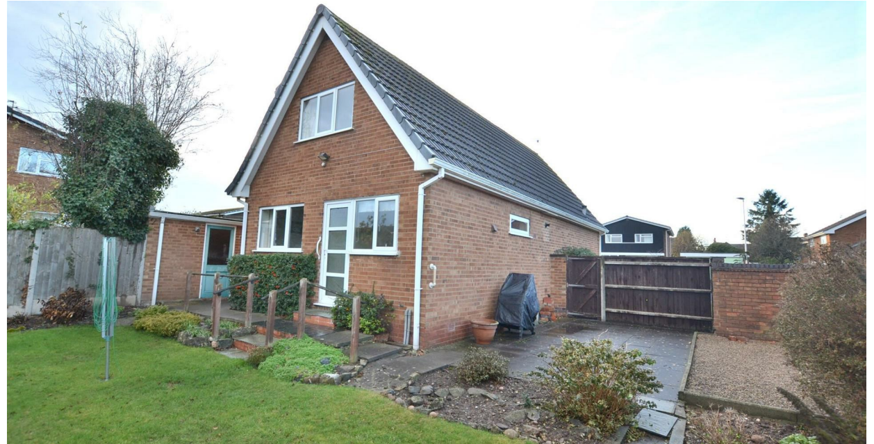
8 Romway Close, Shepshed, Loughborough, LE12 9DT