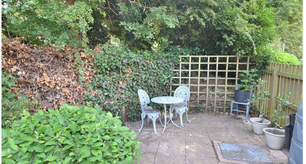
'Knightthorpe Lodge', 1 Windleden Road, Loughborough, Leicestershire, LE11 4HD