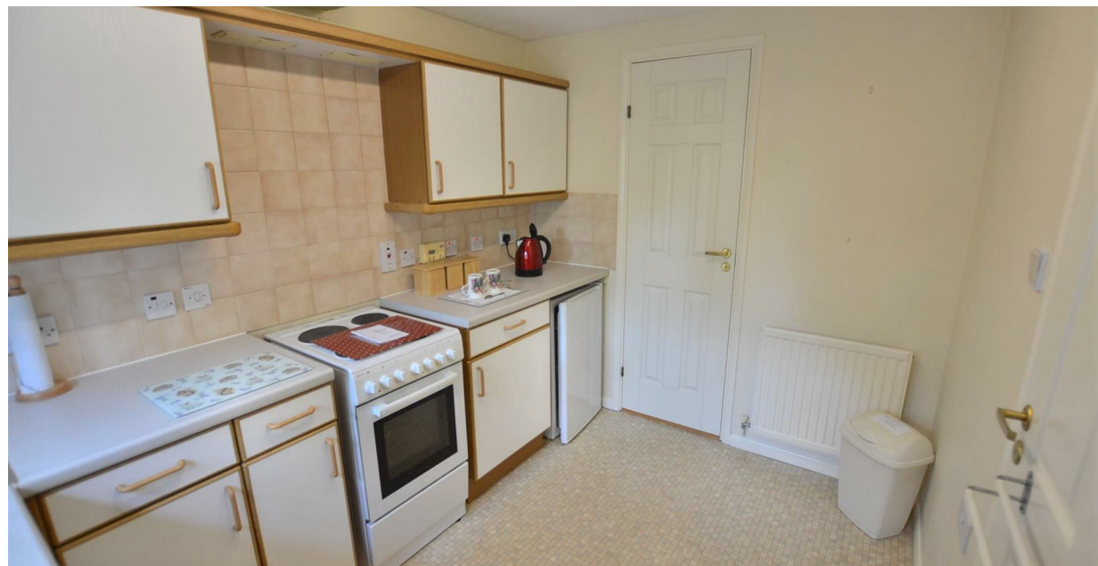
'Knightthorpe Lodge', 1 Windleden Road, Loughborough, Leicestershire, LE11 4HD