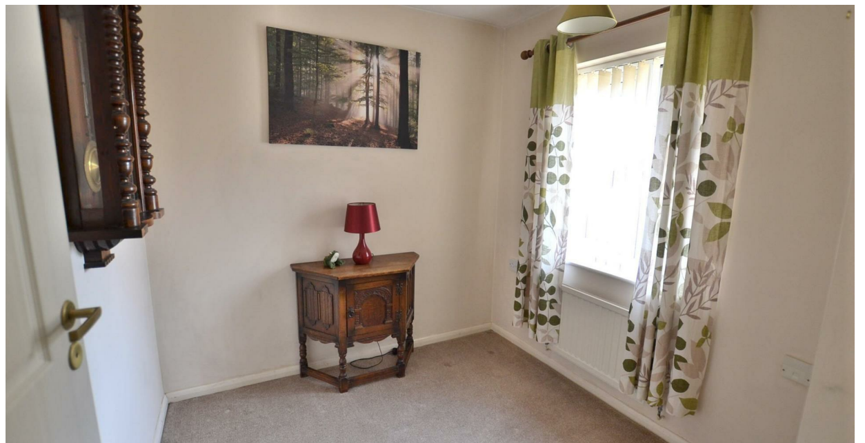
'Knightthorpe Lodge', 1 Windleden Road, Loughborough, Leicestershire, LE11 4HD