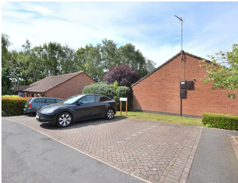
'Knightthorpe Lodge', 1 Windleden Road, Loughborough, Leicestershire, LE11 4HD