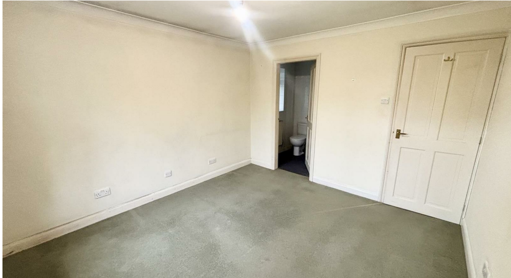
4 Pudding Bag Lane, Shepshed, Leicestershire, LE12 9GD