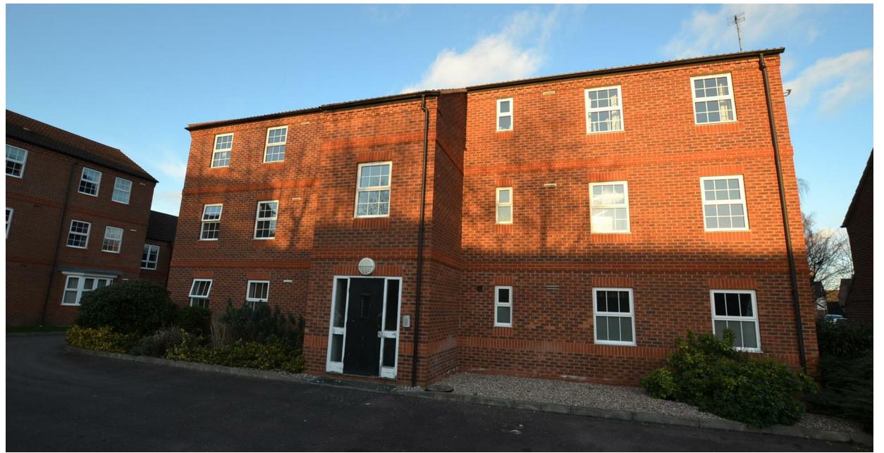
30 Moir Close, Sileby, Leicestershire, LE12 7RN