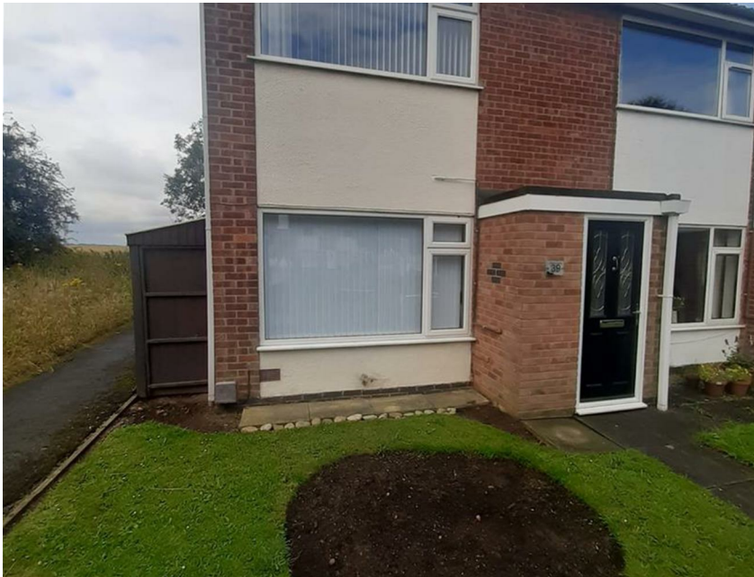
39 Millers Close, Syston, Leicestershire, LE7 2JD