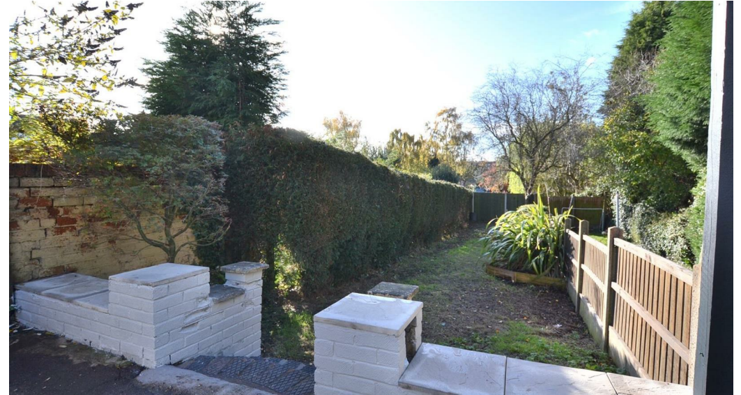
39 Kirkhill, Shepshed, Leicestershire, LE12 9PA