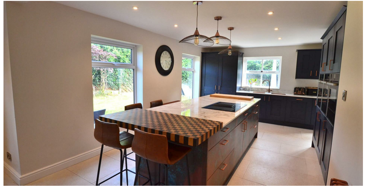
Orchard House, 2 Main Street, Osgathorpe, Leicestershire, LE12 9TA