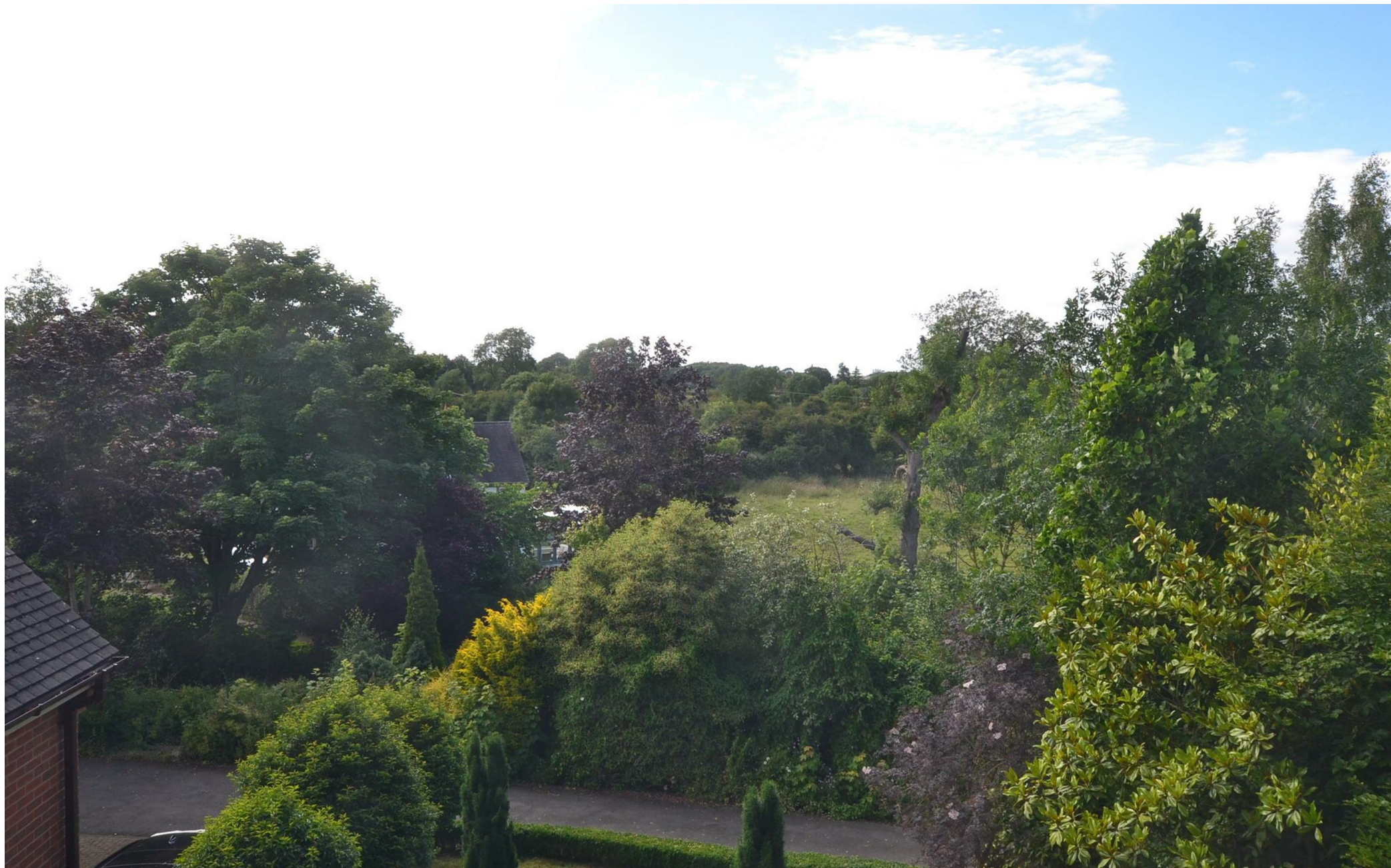
Orchard House, 2 Main Street, Osgathorpe, Leicestershire, LE12 9TA