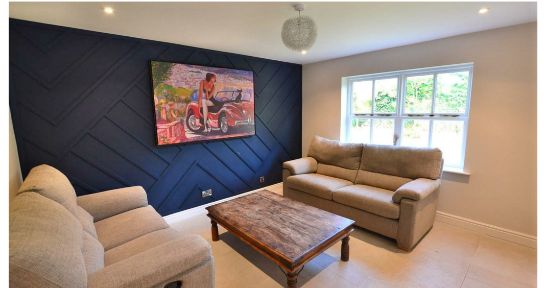
Orchard House, 2 Main Street, Osgathorpe, Leicestershire, LE12 9TA