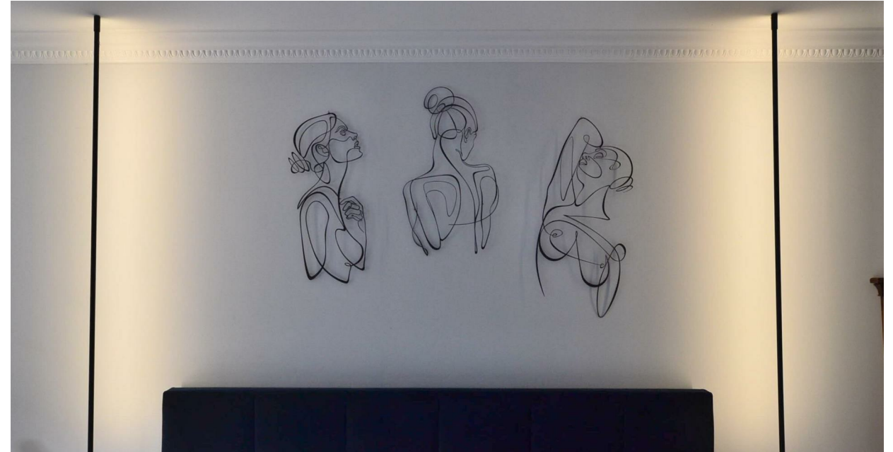
Orchard House, 2 Main Street, Osgathorpe, Leicestershire, LE12 9TA