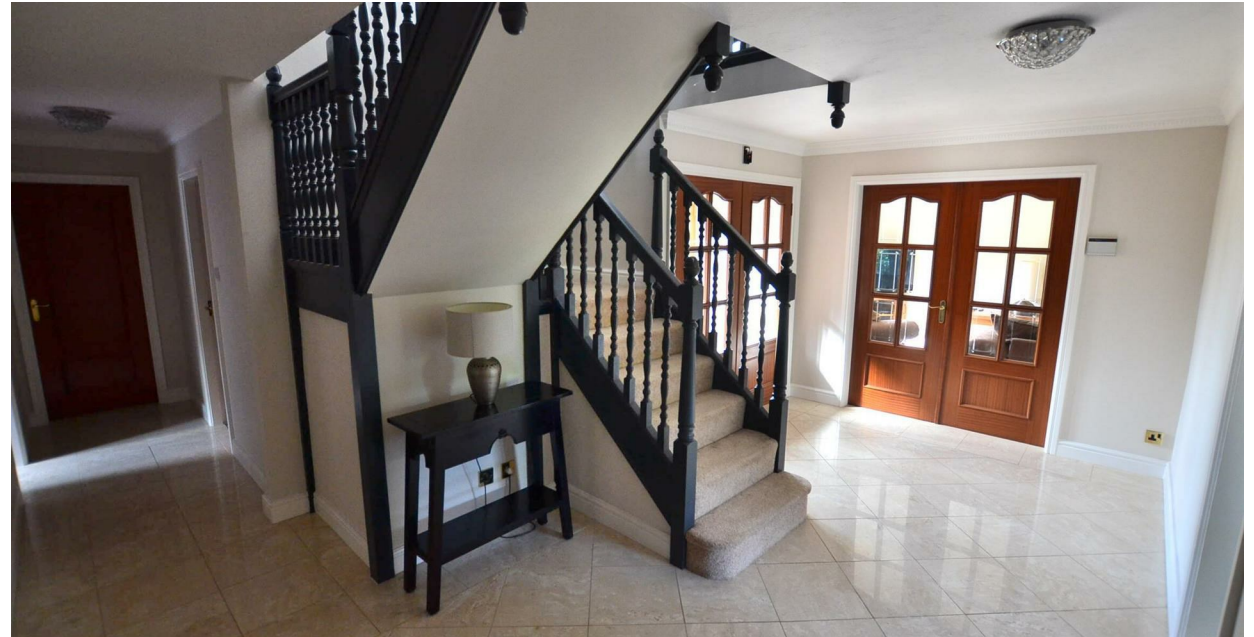
Orchard House, 2 Main Street, Osgathorpe, Leicestershire, LE12 9TA