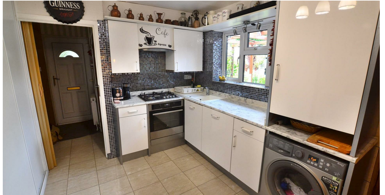
57 St. James Road, Shepshed, Leicestershire, LE12 9JB