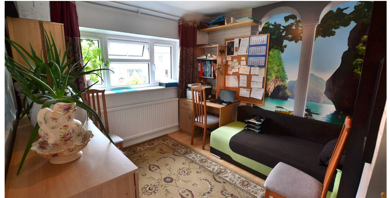
57 St. James Road, Shepshed, Leicestershire, LE12 9JB