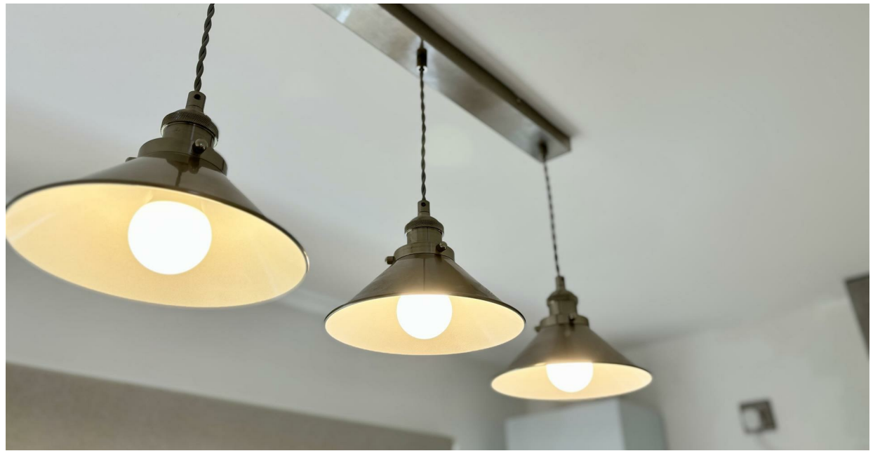
49 High Meadow, Hathern, LE12 5HW