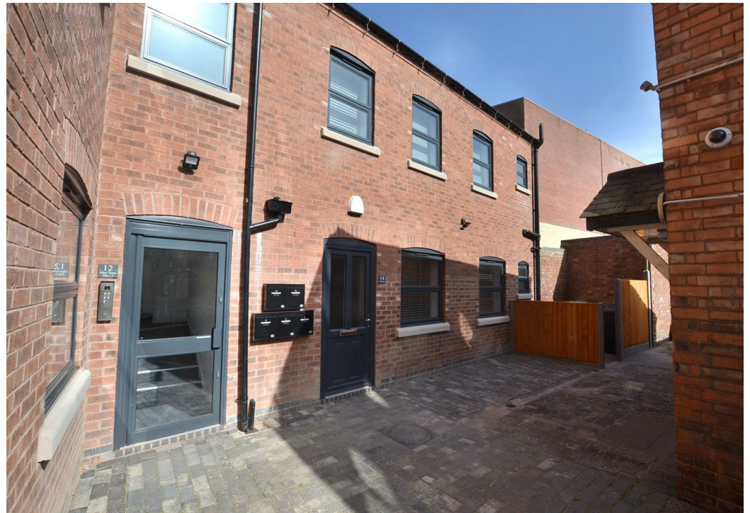
Flat 1 12 Albert Terrace, Off High Street, Loughborough, Leicestershire, LE11 2DE