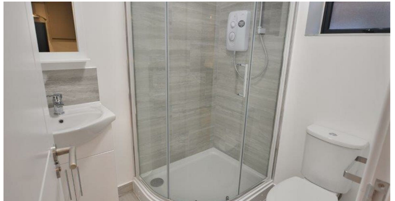
Flat 1 12 Albert Terrace, Off High Street, Loughborough, Leicestershire, LE11 2DE