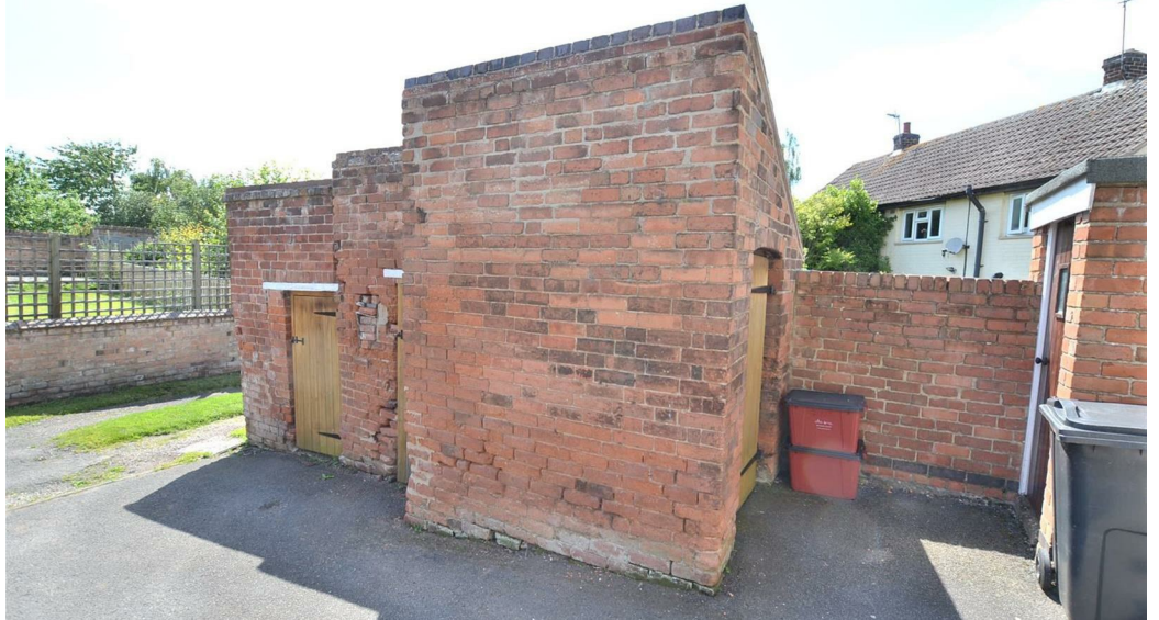
21 Market Place, Belton, Leicestershire, LE12 9UH