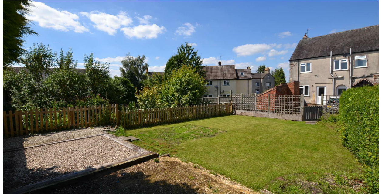
21 Market Place, Belton, Leicestershire, LE12 9UH