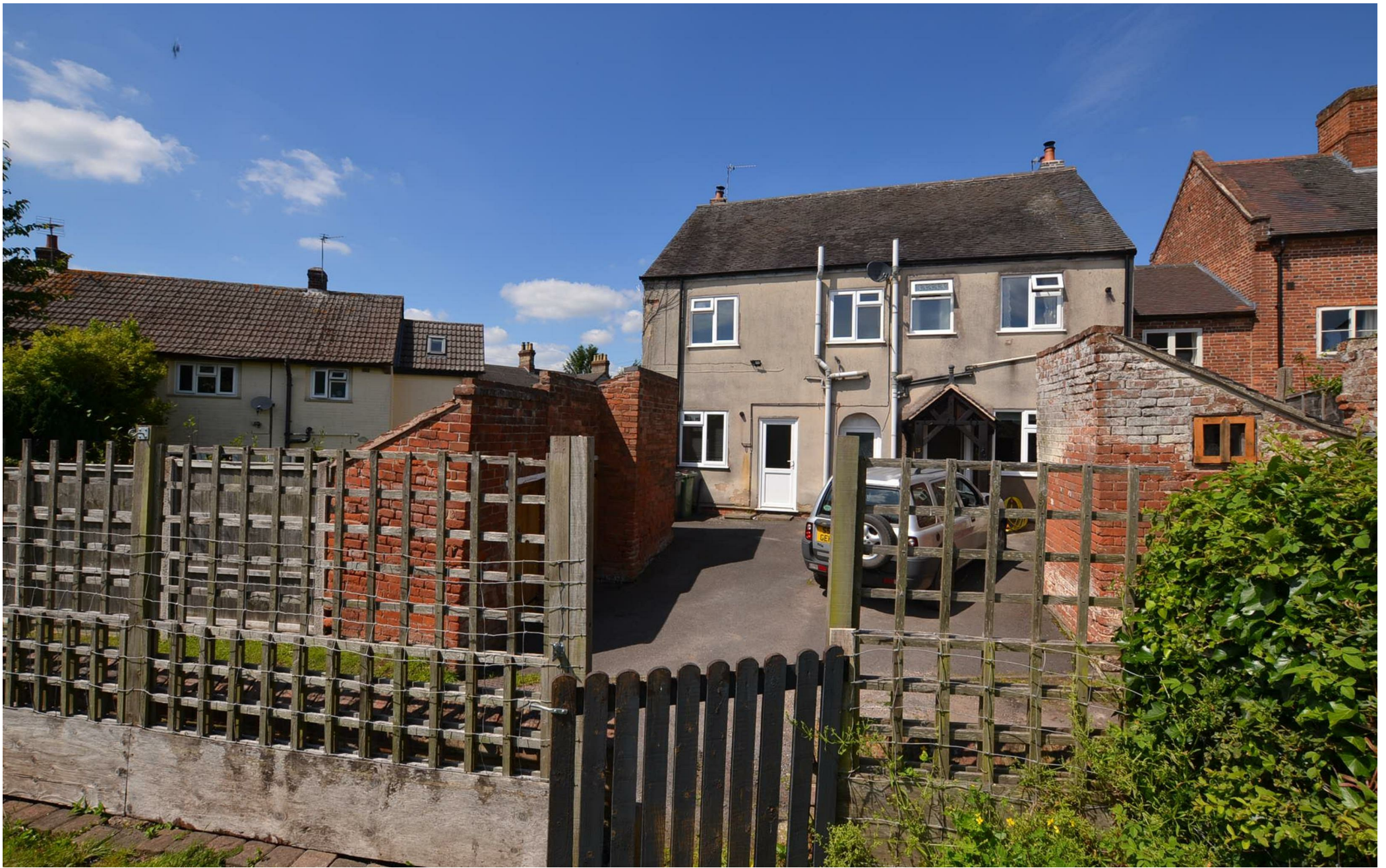
21 Market Place, Belton, Leicestershire, LE12 9UH