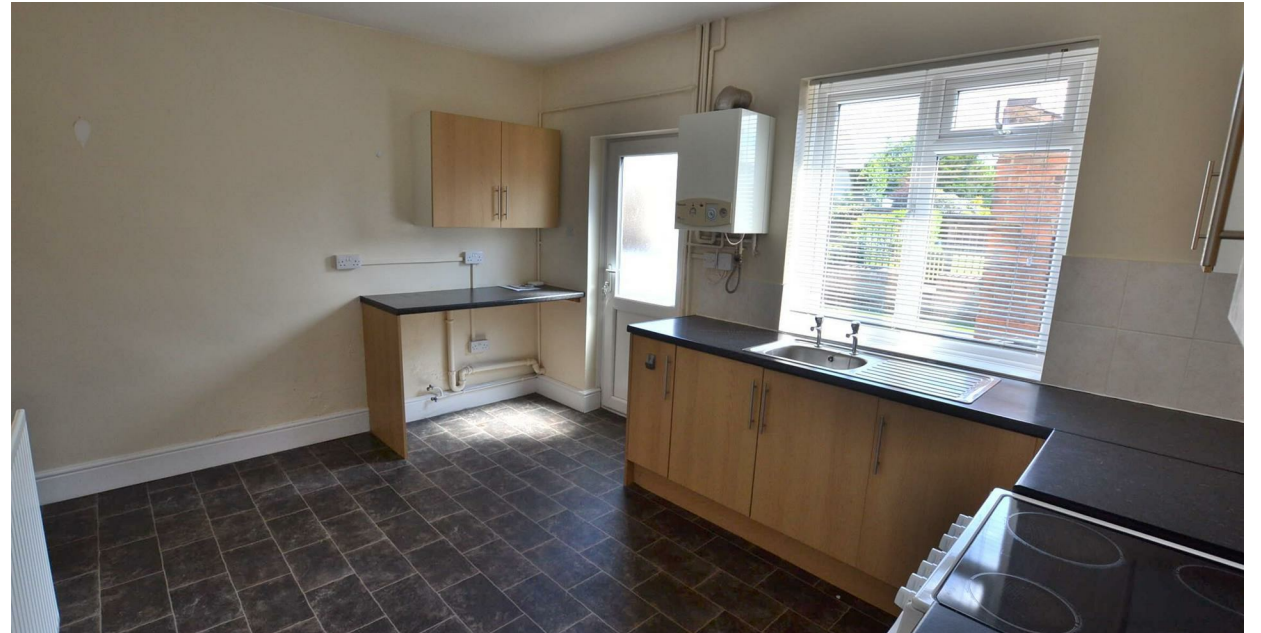
21 Market Place, Belton, Leicestershire, LE12 9UH