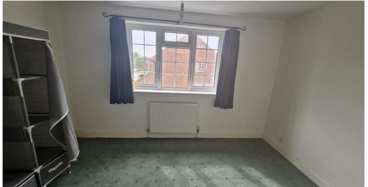
11 Redmires Close, Loughborough, LE11 4EP