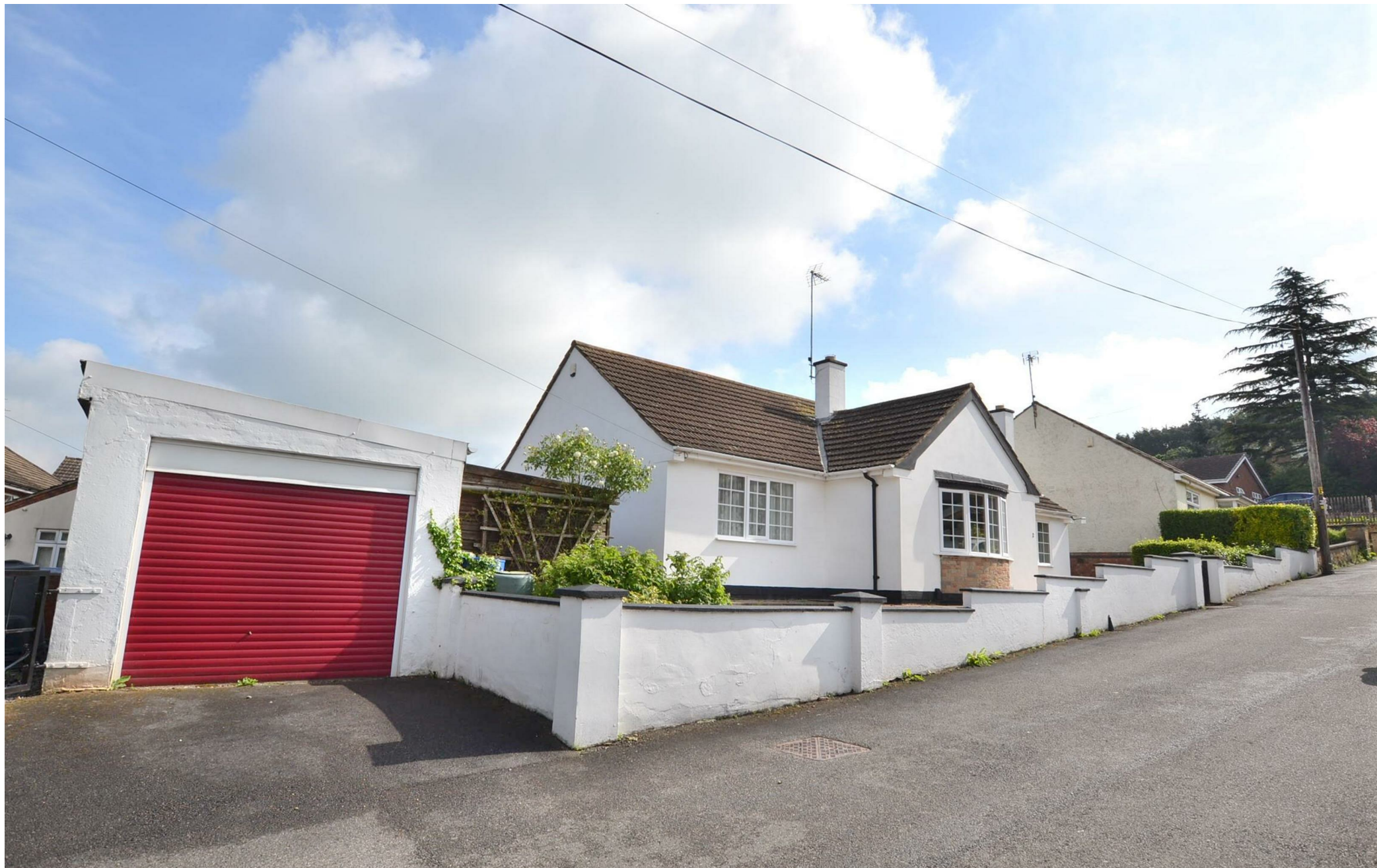
2 Dovecote, Shepshed, Leicestershire, LE12 9RW