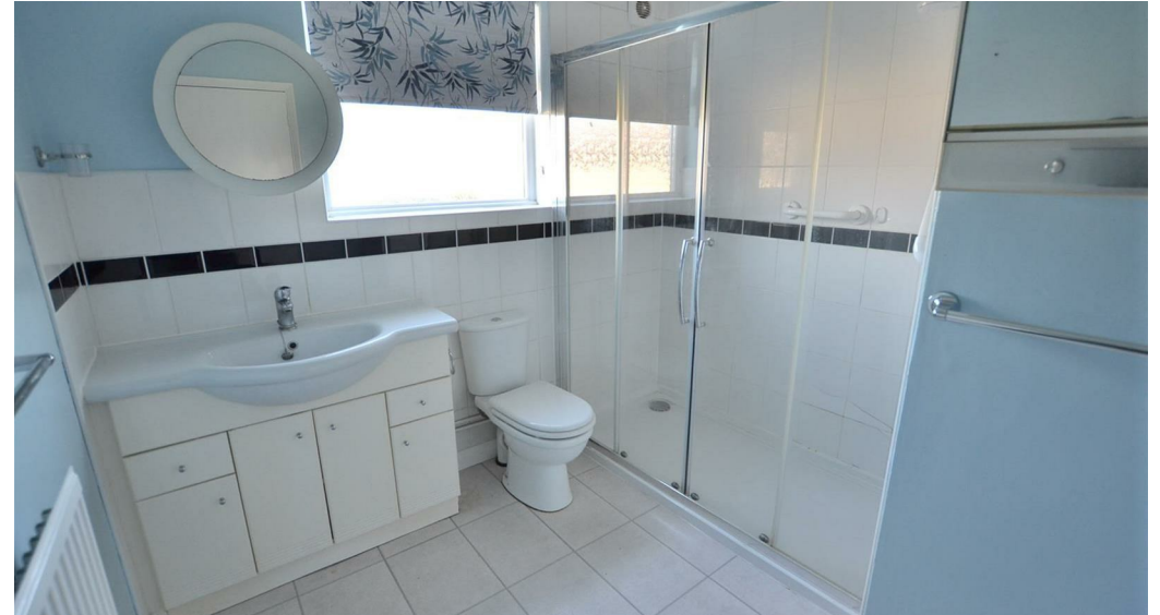
2 Dovecote, Shepshed, Leicestershire, LE12 9RW