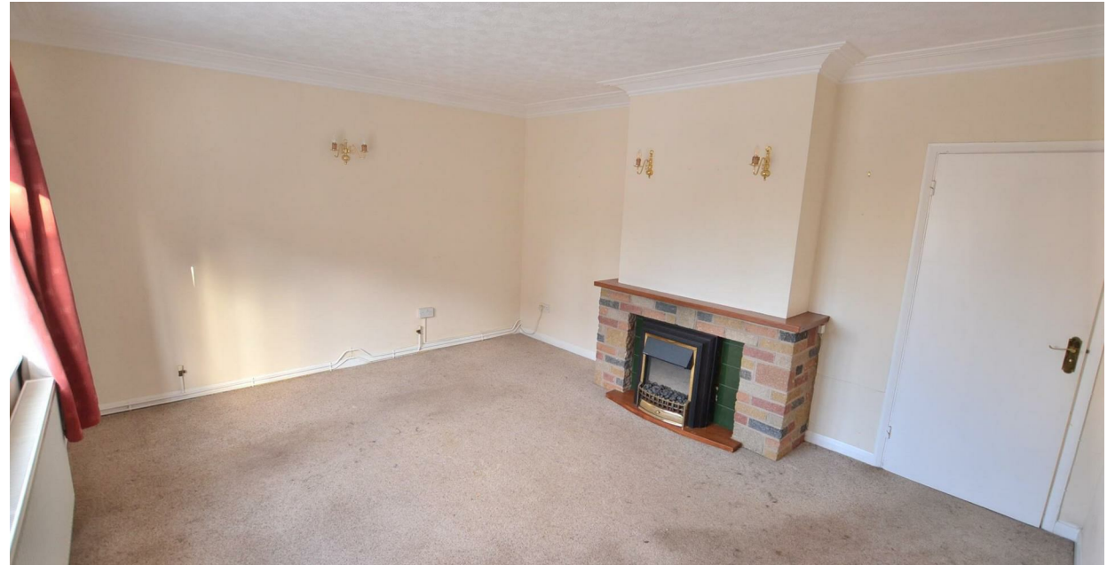
2 Dovecote, Shepshed, Leicestershire, LE12 9RW