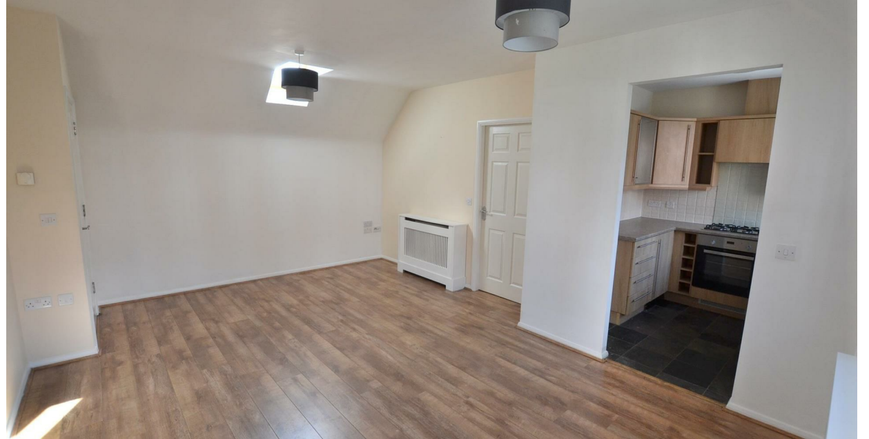
22a Willow Road, Barrow Upon Soar, Leicestershire, LE12 8GQ