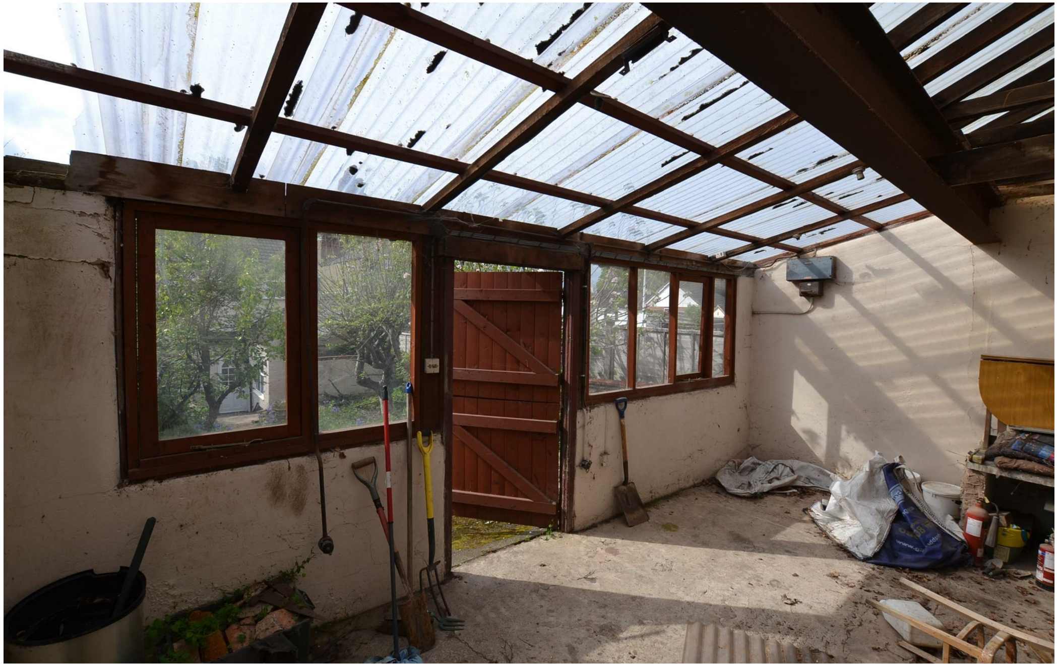
'Apple Tree Cottage', 19 Brook Street, Shepshed, Leicestershire, LE12 9RE