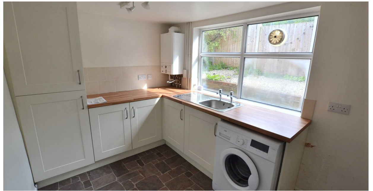
'Apple Tree Cottage', 19 Brook Street, Shepshed, Leicestershire, LE12 9RE