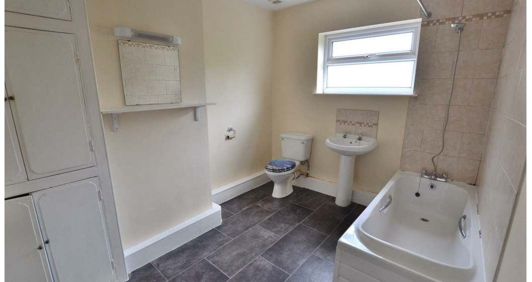
'Apple Tree Cottage', 19 Brook Street, Shepshed, Leicestershire, LE12 9RE