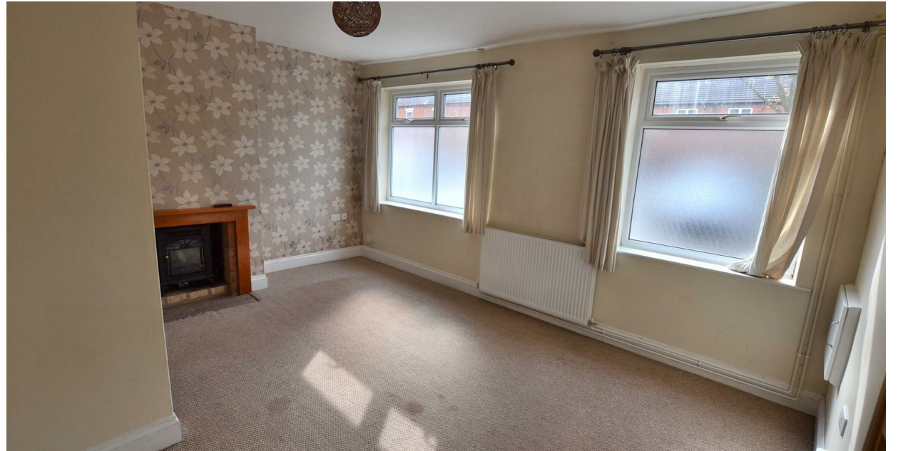
'Apple Tree Cottage', 19 Brook Street, Shepshed, Leicestershire, LE12 9RE