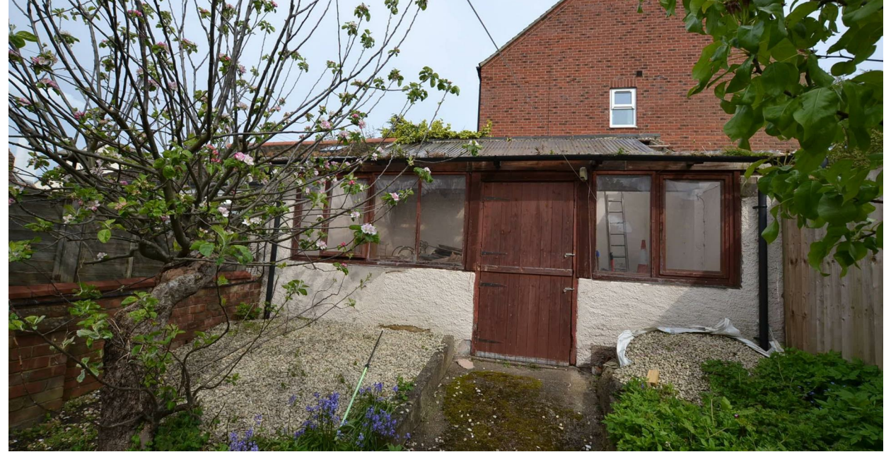
'Apple Tree Cottage', 19 Brook Street, Shepshed, Leicestershire, LE12 9RE