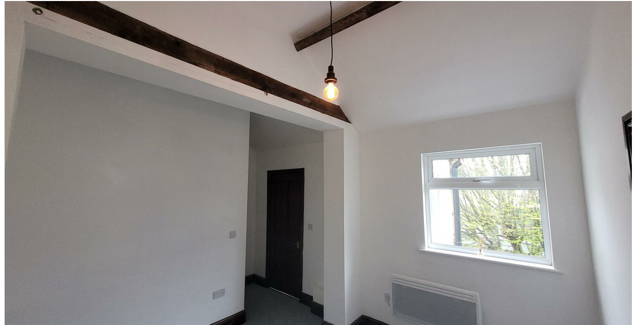
56 Hall Croft, Shepshed, Leicestershire, LE12 9AN