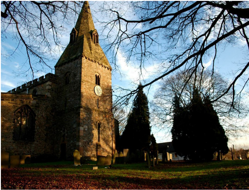
Flat 1 Field House Apartments, Shepshed, Leicestershire, LE12 9AL