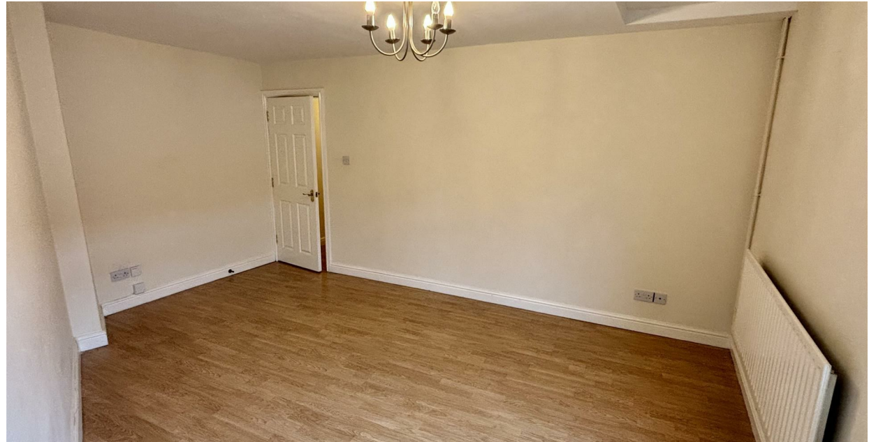
Flat 1 Field House Apartments, Shepshed, Leicestershire, LE12 9AL