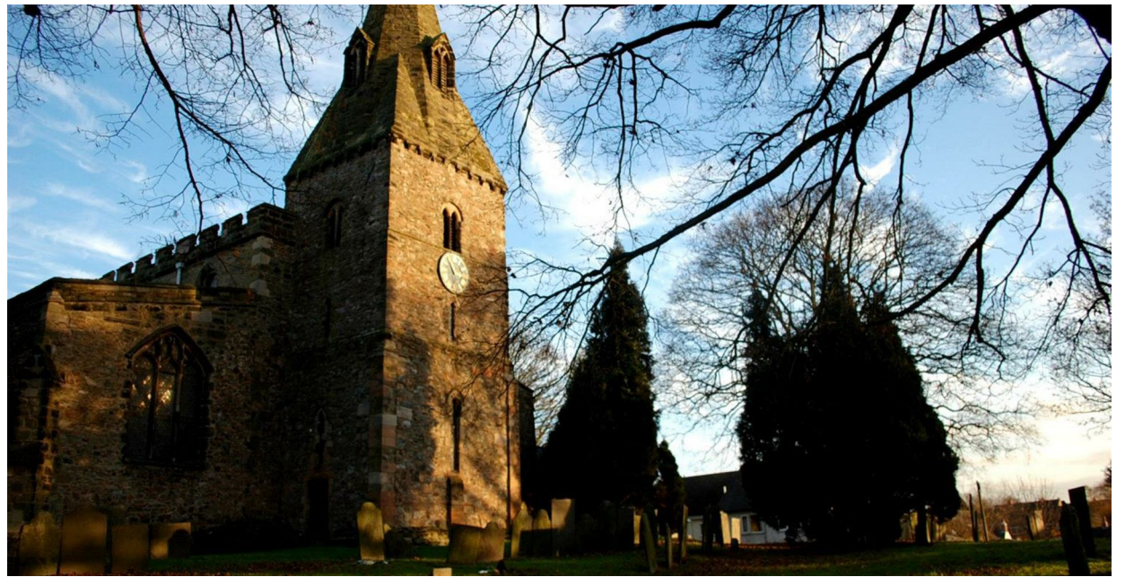
48 The Meadows, Shepshed, Leicestershire, LE12 9QN