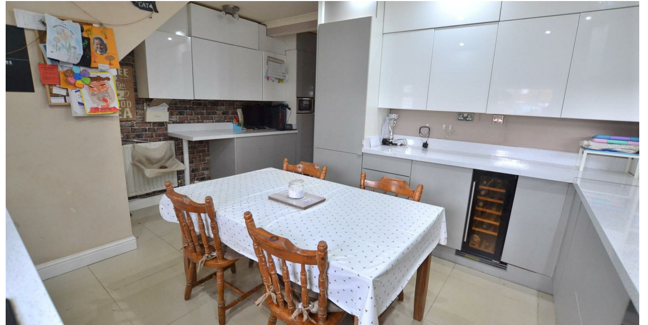
48 The Meadows, Shepshed, Leicestershire, LE12 9QN