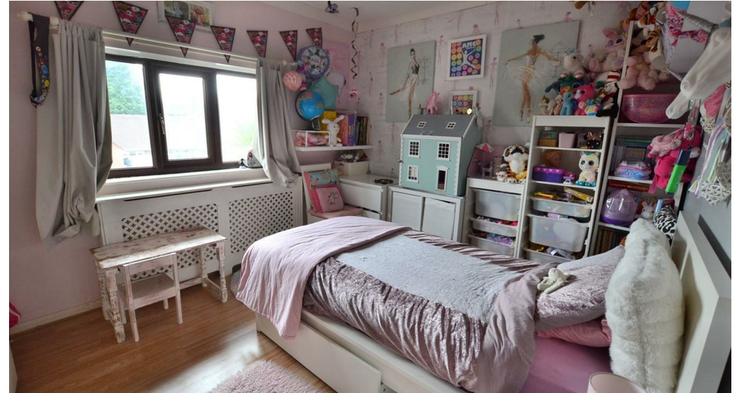
48 The Meadows, Shepshed, Leicestershire, LE12 9QN