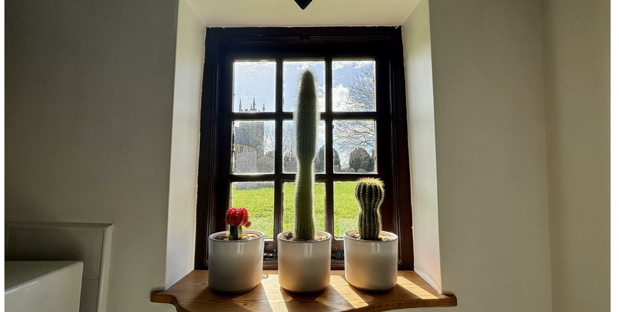
41 Back Lane, Thrustrington, LE7 4TD