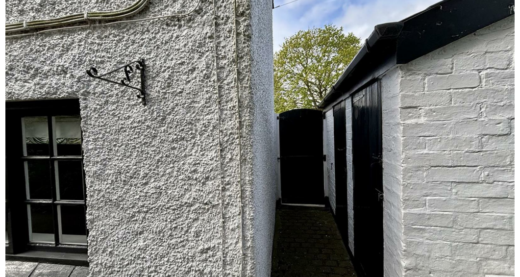
41 Back Lane, Thrustrington, LE7 4TD